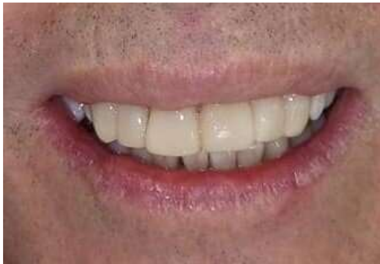
Figure 4. Extraoral photography. Patient's final smile.