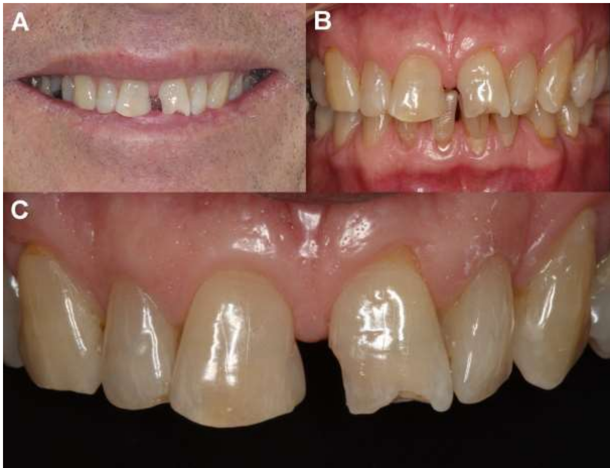
Figure 1. Initial clinical examination. (A) Extraoral smile photography. (B) Intraoral smile photography. (C) Diastema and unsatisfactory aesthetics of upper anterior teeth.