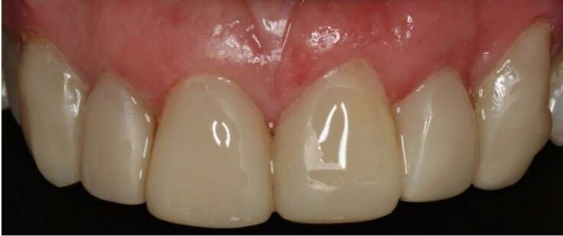
Figure 3. Intraoral photography. Closure of diastema and dental reanatomization.

possible to restore the harmony of the smile, obtaining a satisfactory aesthetic result and improve the patient's self-esteem (Figure 3 and 4).