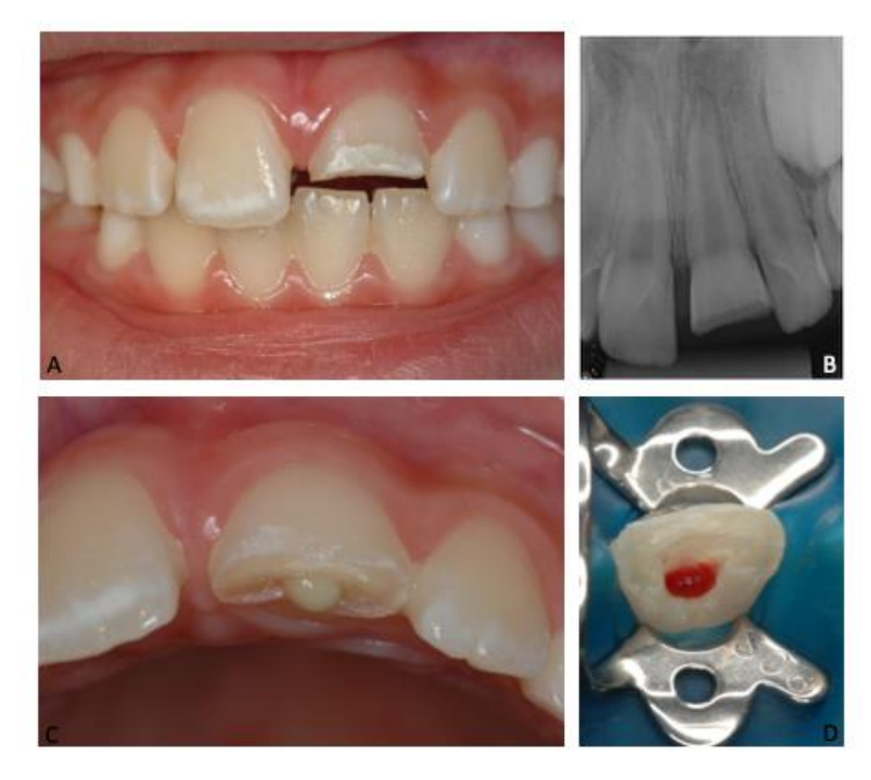
Figure 1 - (A) Pretreatment clinical patient view (30 days after trauma). (B) Preoperative periapical radiograph (30 days after trauma). Immature traumatized tooth with absence of periapical changes and integrity of the lamina dura. (C) Micro abscess sprang out the exposed pulp after emergency dressing was removed. (D) Vitality pulp aspects during the trans-operative procedure.