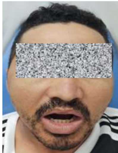
Figure 1 – Extra-oral aspect.

A victim of an accident at work, 15 days ago, suffered a trauma during the installation of a marble statue in the right malar region with a sinking of the region. During the physical examination, a mouth opening restriction of less than 20 mm was found, as shown in Figure 1.