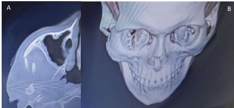
Figure 2 - Preoperative computed tomography of the face.