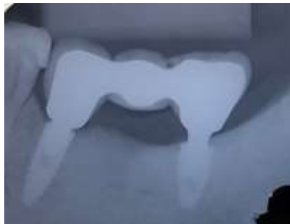
Figure 3. Radiographic aspect at time of prosthetic placement.