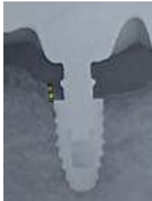
Figure 5. Moment of measurement of the distance from the mesial bone crest to the implant platform, in the Image J software TD .