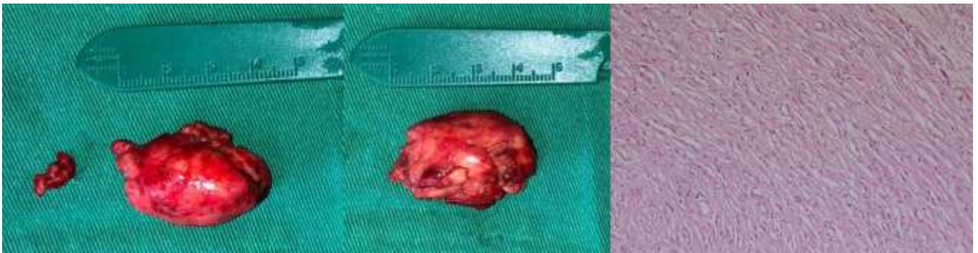
Figure 5. Macroscopic aspect of the lesion (left and right side). Histopathology demonstrated well-spaced, spindle-shaped cells with elongated, thin nuclei and scant cytoplasm, surrounded by a collagenous matrix situated in the myxoid stroma. Later immunohistochemical analysis was positive for staining with Vimentin and the cells were positive for protein S-100 and CD57, consistent with neural tissue origin.

The specimen was sent to histopathological evaluation with additional immunohistochemical screening, with the final diagnosis of neurofibroma and positive staining for S-100 protein, with no evidence of ongoing mitosis (Figure 5). The patient attended follow-up consultations at 1 week, 1 month, and 6 months, never returning afterward. No infection occurred during this period, local mucosa healed well and the patient's only referred local numbness, without major distresses.