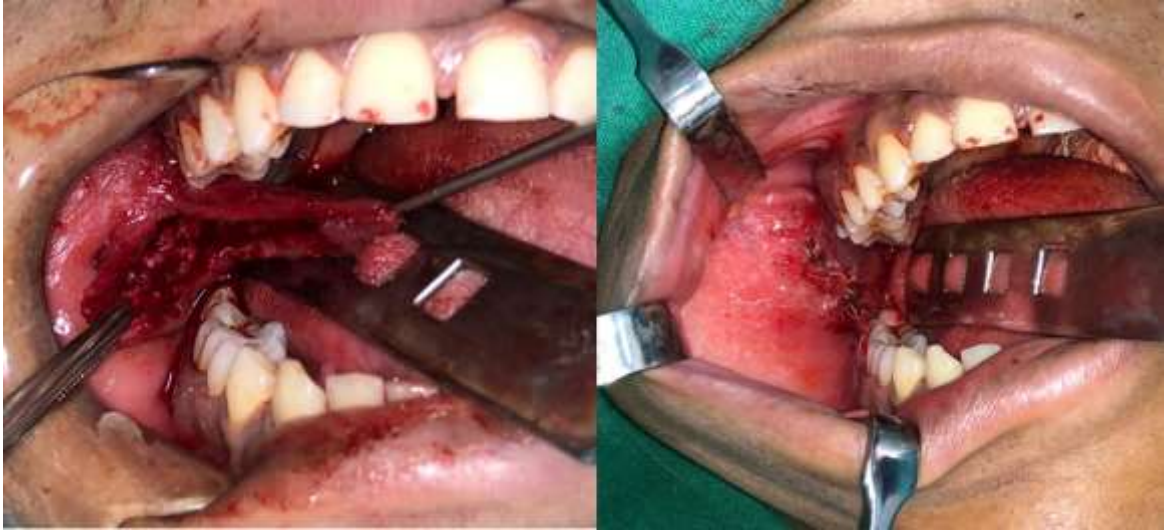
Figure 4. Intra-oral aspect of the surgical site after complete excision of the lesion, excess of mucosa was removed and simple continuous resorbable suture was performed.