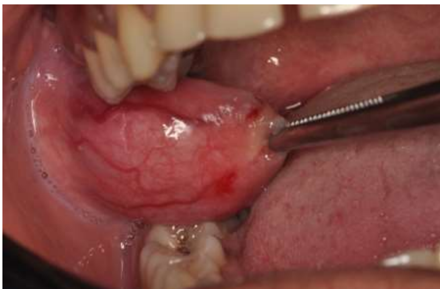
Figure 2. Intra-oral closely view of the tumor with superficial vessels under buccal mucosa. Previous aspiration of the lesion was negative.

During the clinical evaluation, the right cheek area showed a large sessile, elastic consistency, and circumscribed mass, which was covered by normal movable mucosa and presented some vessels visible through it, the lesion itself measured approximately 3,5 x 2,5 x 2cm (Figure 2). We sought for body signs, and no evidence of cutaneous or subcutaneous lesions, nor brown-pigmented café-au-lait spots on the trunk and upper arms were found. We performed fine-needle aspiration with a negative result for liquids or blood, and based on the clinical features, the presumptive diagnosis was lipoma, fibroma, or traumatic neuroma.