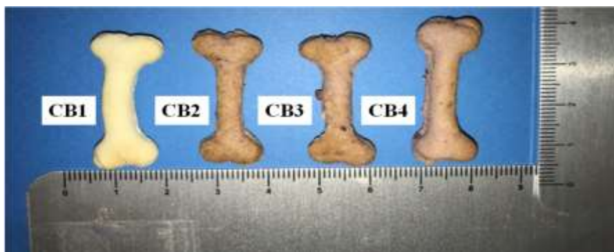
Figure 1. Scanned images of the canine vegan biscuits CB1 (control, without inulin), CB2 (30 g/kg of inulin), CB3 (60 g/kg of inulin), and CB4 (90g/kg of inulin).

Values expressed as mean ± standard deviation. Different letters in the line differ by the Scott-Knott test (p-value<0.05); n.s.: not significant. n.d.: not determined. 2 Calculated according to the suppliers' information for total dietary fiber of ingredients. 3 Calculated by difference. 4 cP: centipoises. 5 Trainers's perception: 4= The dog enjoyed the sample; 3= The dog was indifferent. Source: Authors.