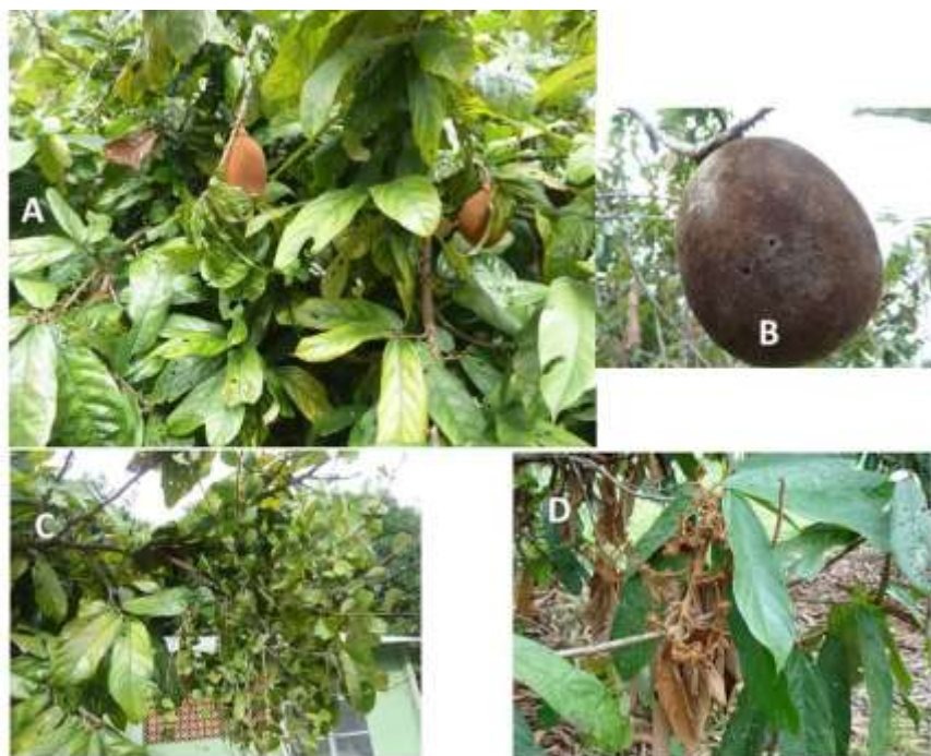
Figure 1. Cupuassu with Magnesium deficiency (A); with fruit borer (B); with herb of bird (C); with witches' broom (D).

If producers had conducted soil management and pests and diseases control as recommended by Venturieri et al. (1985), their pulp yields could increase to an average of 2,200 kg/ha. If they had adopted the recommendations of Souza et al. (1999), their average productivity would be 3,043 kg/ha. The seeds production, following Venturieri et al. (1985), would be 1,000 kg/ha or, according to Souza et al. (1999), 1,257 kg/ha.