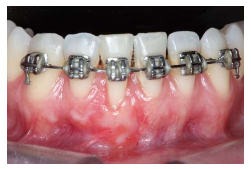
Figure 8. Postoperative control after one month.

The treatment proposed allowed a satisfactory result (Figure 8).