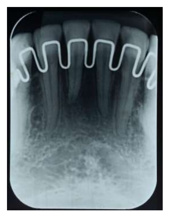
Figure 3. Initial radiographic aspect.

The root presented vestibularization in relation to adjacent teeth and root exposure to the apical region (Figure 2). There was absence of inserted gingiva, with consequent accumulation of biofilm and presence of severe gingival inflammation in the site.