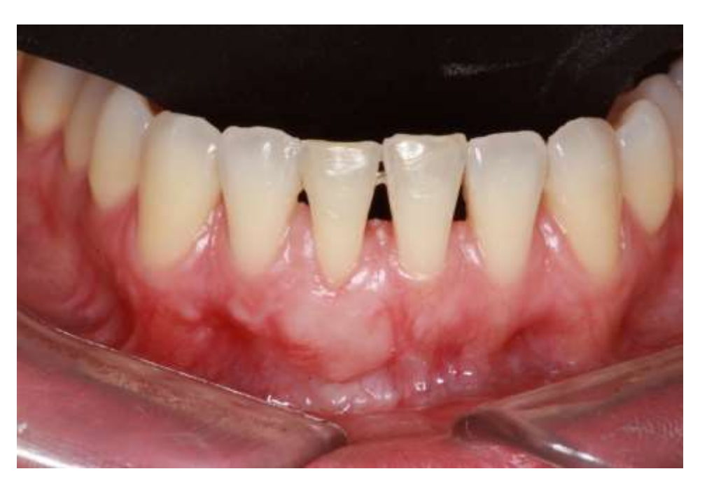
Figure 10. Postoperative control after fourteen months.