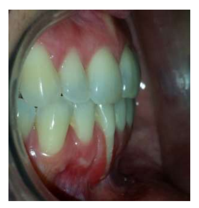
Figure 2. Positioning of the dental root for the vestibular of the dental arch.