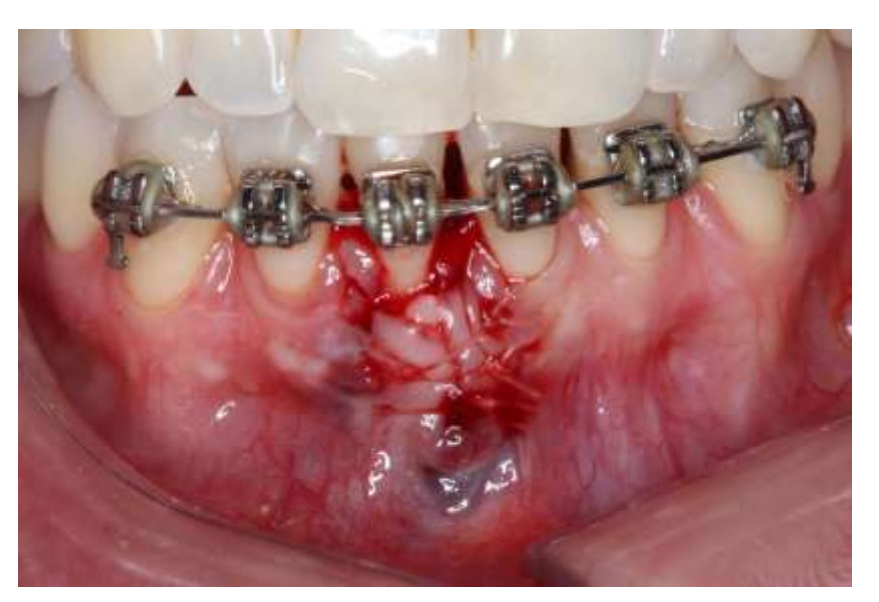
Figure 7. Final appearance of the graft.

The coating technique consisted of a removal of the epithelium from the margins of the gingival recession through the use of a scalpel blade 15c; sulcular incision; a split flap was then made, preserving the margin of the adjacent papillae, providing space for the insertion of the connective tissue graft and the movement of the flap to the graft covering, from the maxillary tuberosity region (Figure 6), and the was root previously exposed.