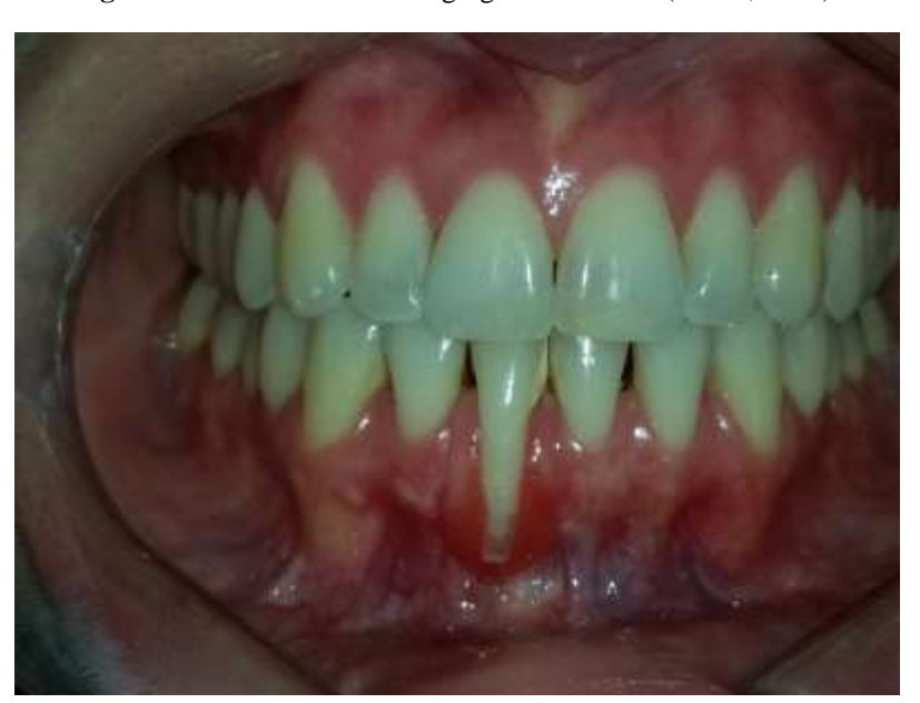
Figure 1. Presence of class III gingival recession (Miller, 1985).

A 36-year-old woman patient attended the clinic for an evaluation of the right lower central incisor, which had previously been submitted to a free gingival graft and, after a result of the therapy, still presented great radicular exposure (Fig. 1). She had also undergone orthodontic treatment for about a year.