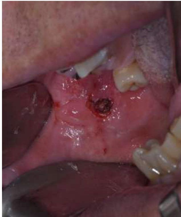
Figure 7 - Final aspect after sialolith removal and hemostasis.