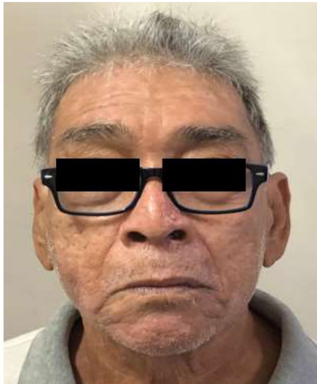
Figure 8 - Final clinical aspect after 2 months of treatment.