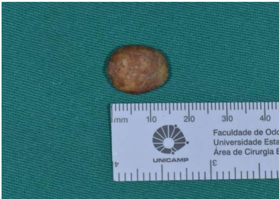
Figure 6 - Giant parotid sialolith (>15mm).

A small amount of purulent mucous saliva was discharged after reaching the Stensen's duct surgically and the sialolith was removed afterwards. The sialolith measured 16 X 12 mm (Figure 6).