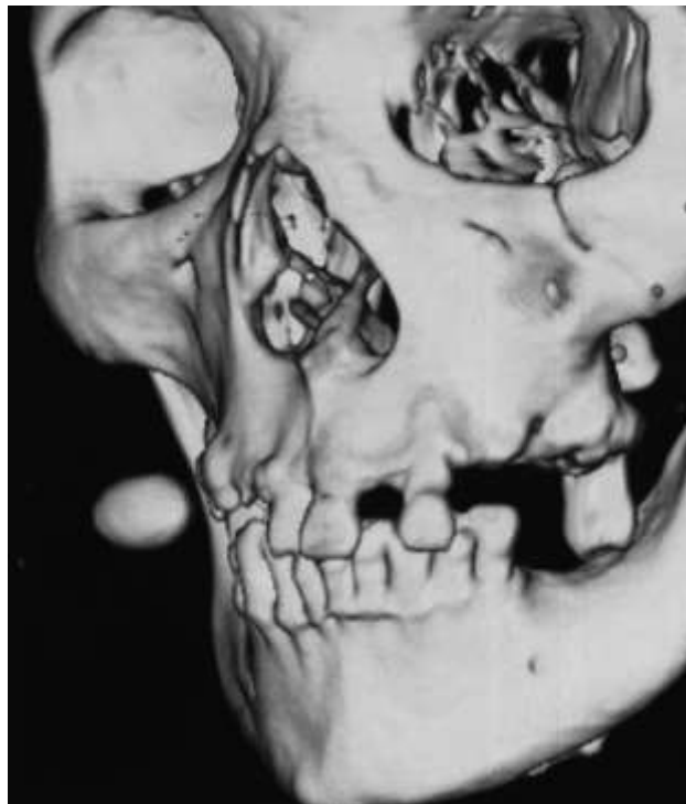
Figure 3 - Hyperdense oval image in buccal space, on the right side, in 3D CT image.