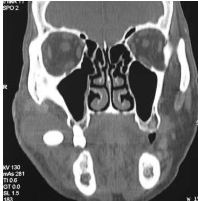
Figure 2 - Coronal view in computed tomography showing hyperdense oval image in swelled buccal space, suggestive of parotid sialolith on the right side.