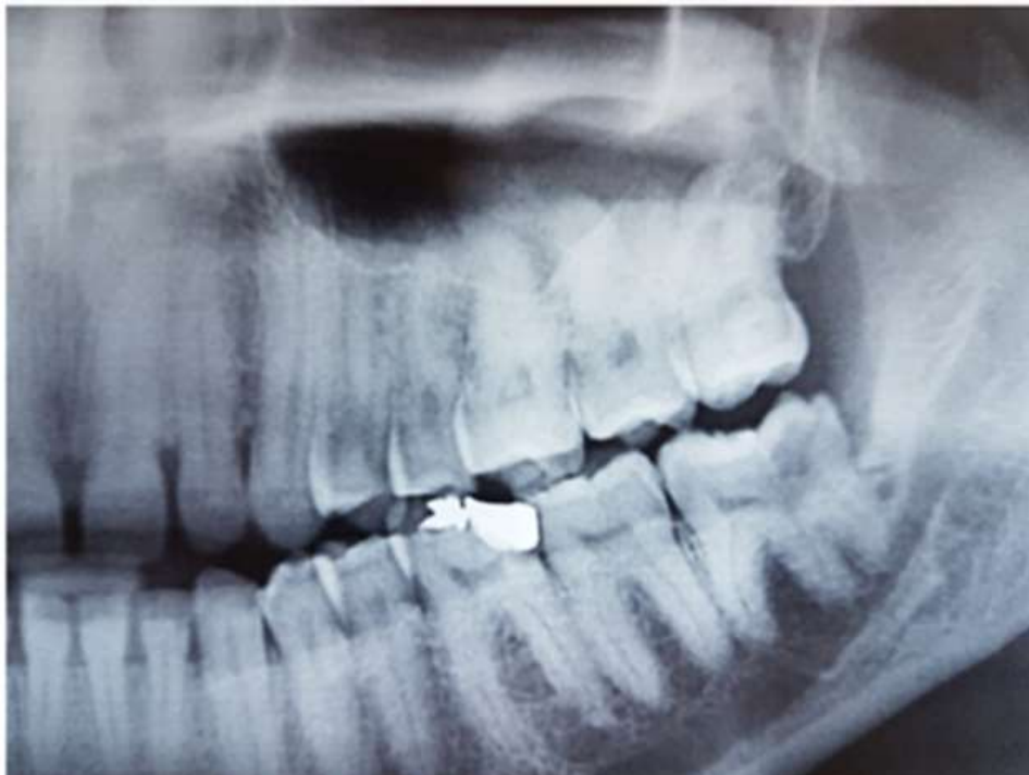
Figure 2. Preoperative panoramic radiography. Cut radiograph, widening the view of the area of interest 38 fused with 4 o molar.