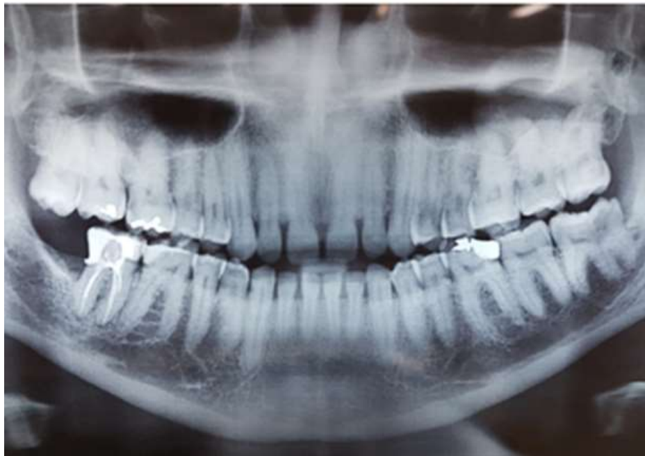
Figure 1. Preoperative panoramic radiography. Total view of the radiograph, which showed the presence of the upper third molars (18 and 28), left lower third molar (38) fused with supernumerary tooth - 4th molar and absence of tooth 48.