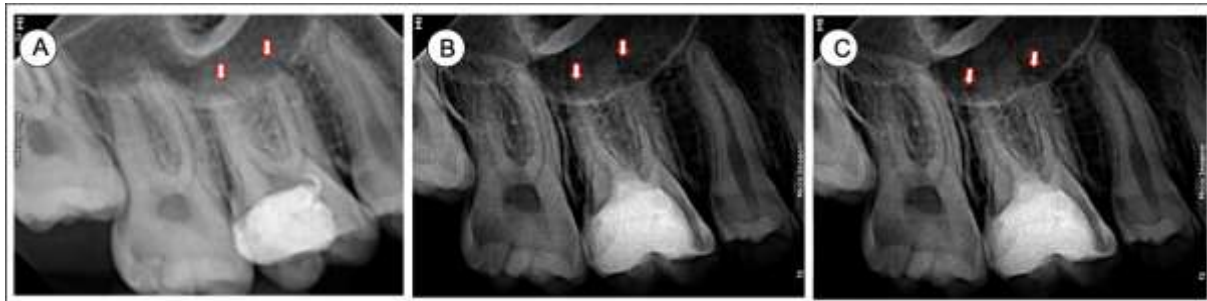
Figure 1 - (A) X-ray image of mandibular first molar showing complete root canal formation and slight thickening of the periodontal ligament (arrows). (B) X-ray image of six-month follow-up showing normal root canal apex appearance (arrow). (C) Final X-ray image after fifteen-month follow-up showing reduction in the canal volume (arrow).

It is possible to observe that at the initial appointment, only the lingual root canal had a slightly open apex, which was confirmed after endodontic file exploration. The other root canals were not large, and periodontal ligament space was slightly thickened, although no radiographic periapical lesion was present. The tooth was classified as healed at 12 months after endodontic treatment, with a reduction in the space of the periodontal ligament for normal parameters. A slight reduction of the canal lumen was also observed.