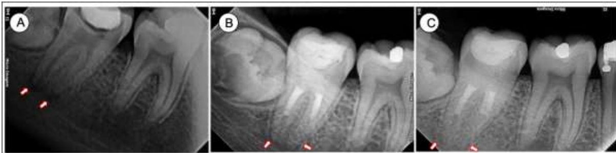
Figure 4 - (A) X-ray image of mandibular first molar showing larger volume of root canal and open distal canal apex (arrows). (B) X-ray image of six-month follow-up demonstrating normal appearance of both root canal apices (arrow). (C) Final X-ray image after fifteen-month follow-up showing reduction in the canal volume and the apex closing (arrow).

The clinical case 4 had a large distal canal, but at 6 months after treatment, signs of volume reduction and apical repair were identified, which was confirmed at the end of the follow-up period. Clinical case 5 (Figure 5A-5C) was the youngest patient (9 years old), presenting more voluminous canals compared to the others, thinner dentinal walls and all open apices.