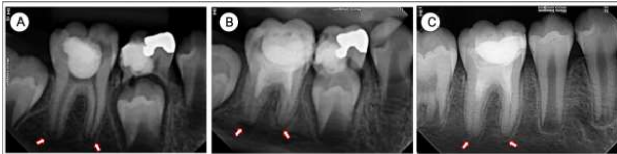
Figure 5 - (A) X-ray image of mandibular first molar showing larger volume of root canal and both open canal apices (arrows). (B) X-ray image of three-month follow-up demonstrating reduction in canal lumen and normal appearance of both root canal apices (arrow). (C) Final X-ray image after fifteen-month follow-up showing greater reduction in the canal volume and both apices closing (arrow).