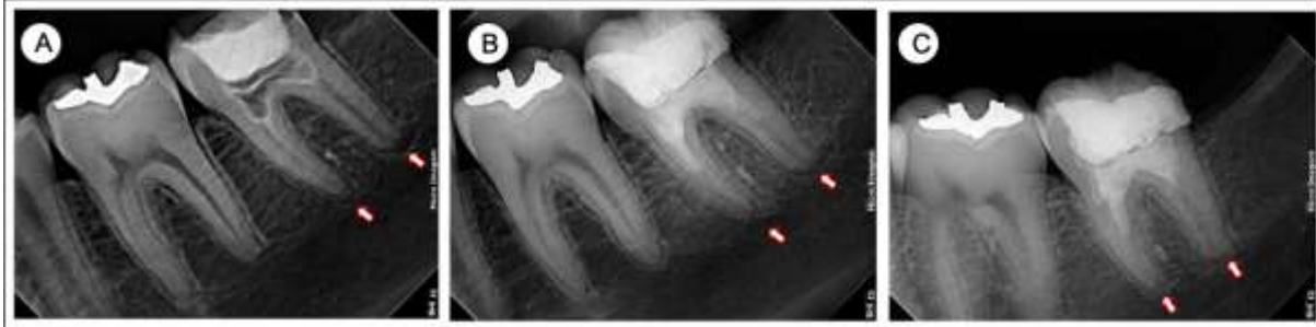
Figure 3 - (A) X-ray image of mandibular second molar showing open distal canal apex (arrows). (B) X-ray image of six-month follow-up demonstrating normal appearance of both root canal apices (arrow). (C) Final X-ray image after fifteen-month follow-up showing the apex closing (arrow).

Similar to what was observed in case 2, case 3 presented a reduction in the lumen of the root canals, suggesting possible obliteration (Figure 2A-3C).