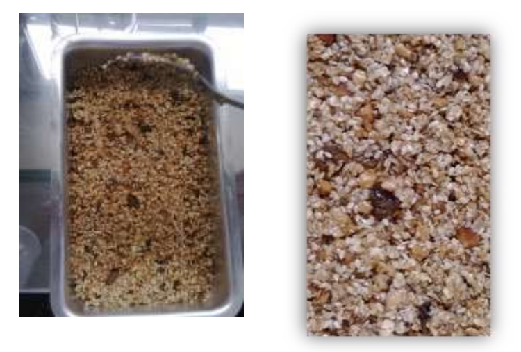
Figure 2. Appearance of the F2 formulation cereal bar.

chemical analyses. As shown in Table 4, the proximate composition of the baru almond cereal bar with pineapple peel (F2) revealed higher contents of carbohydrates, lipids, and proteins.