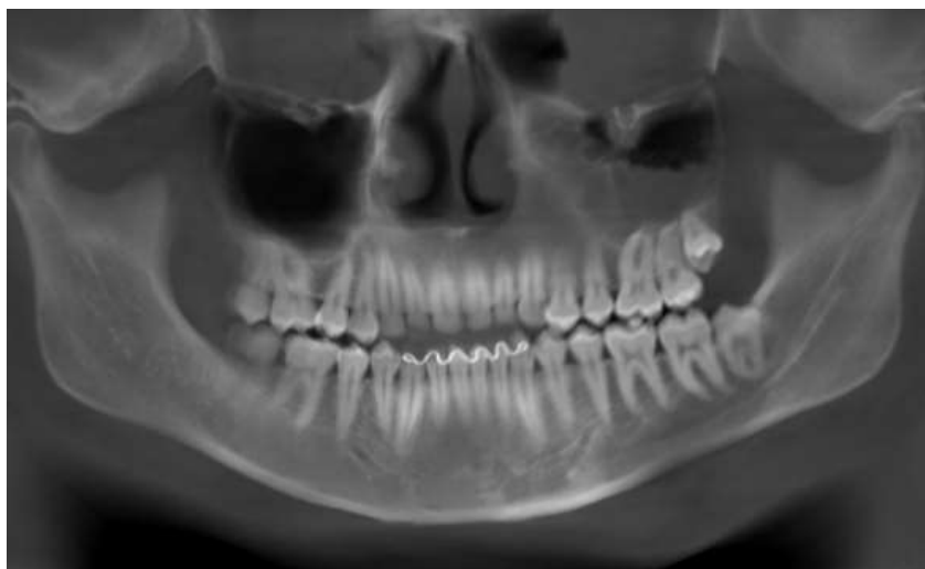
Figure 1. Radiographic image showing sinusitis in the left maxillary sinus.