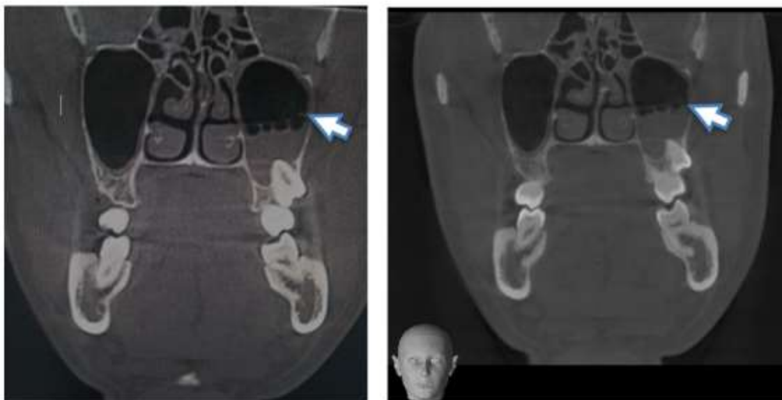
Figure 4. Bubbles on the surface of the sinus fluid (b).