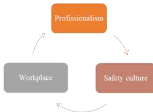
Figure 3. Fundamentals for patient safety.

The provision of measures aimed at reducing errors must come with interventions based on specific points: professionalism, work environment, and safety culture (Figure 3). The first is related to the need for frequent training and updates for health professionals, the provision of adequate staff and professional workload, in addition to the need for improvements in interpersonal communication. The second reinforces the idea that the environment has an influence on actions and thus in health care, requiring environmental control, providing the necessary equipment and supplies in sufficient quantities, and seek to implement the new technologies for the development of safe activities. And, finally, the safety culture, which must be understood and practiced by all sectors of the health unit, since it is essential to improve the clinical status of the patient and protect the workers involved in this process (Wang et al. , 2015).