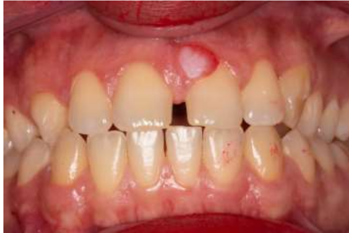
Figure 1. Clinical appearance of the lesion.