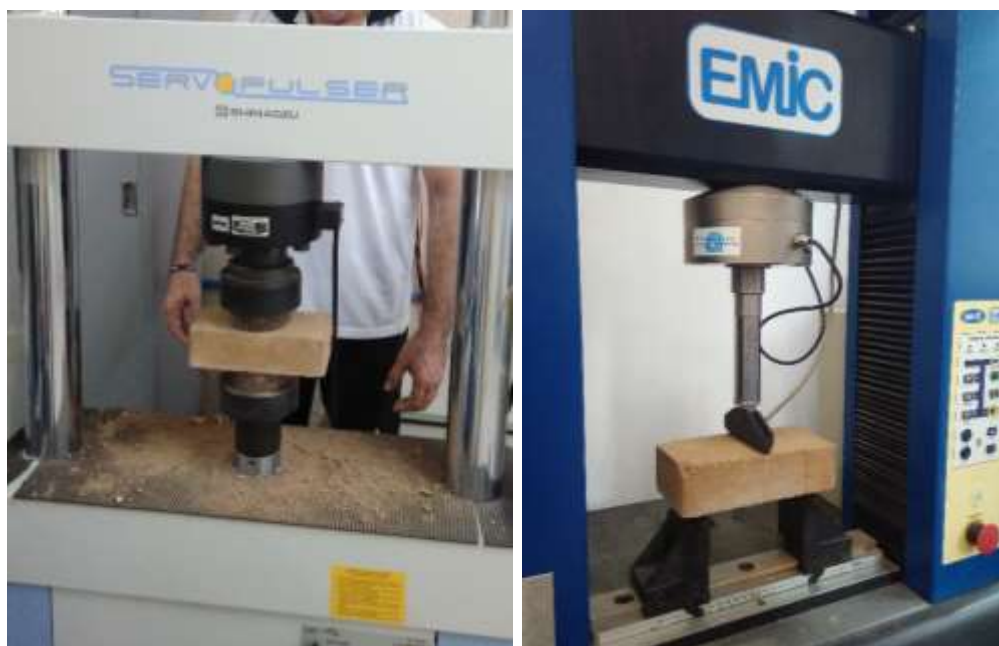
Figure 3 – Conducting tests of compressive strength (left), and flexion (right).

To perform the compressive strength test at 28 days, a SHIMADZU Model ServoPulser hydraulic press with a capacity of 10 Tons was used, equipment belonging to the Pavement Engineering Laboratory (LEP/DEC/CTRN) of UFCG - Campus Campina Grande (Figure 3). As recommended by ABNT NBR 10836:2013, to perform the test, the surfaces of the specimen must be flat and parallel, and the speed of the rupture load must be uniform at a rate of 500 N/s, or 50 Kgf/s.