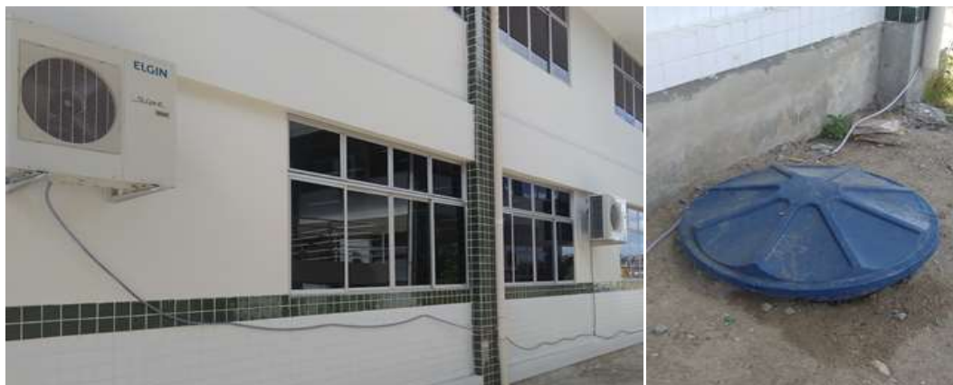
Figure 4 – Drainage scheme for the air conditioners of the IFPB Campus Campina Grande Library.