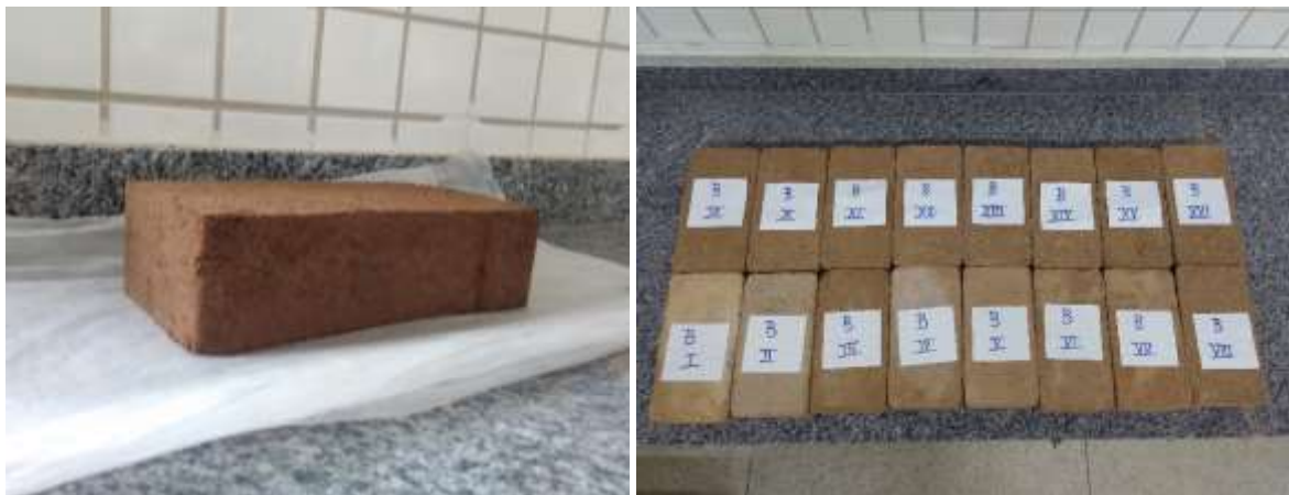
Figure 2 – Visual presentation after pressing, and bench setting during curing.

After the conformation stage, the bricks remained at room temperature until they reached the ages foreseen for the tests. During the first 7 days of air curing, periodic moistening was carried out twice a day to ensure the perfect production of the hydrated phases of Portland cement, taking into account the loss of moisture from the material to the environment associated with heat. hydration of the binder, which occurs through an exothermic process (Figure 2).