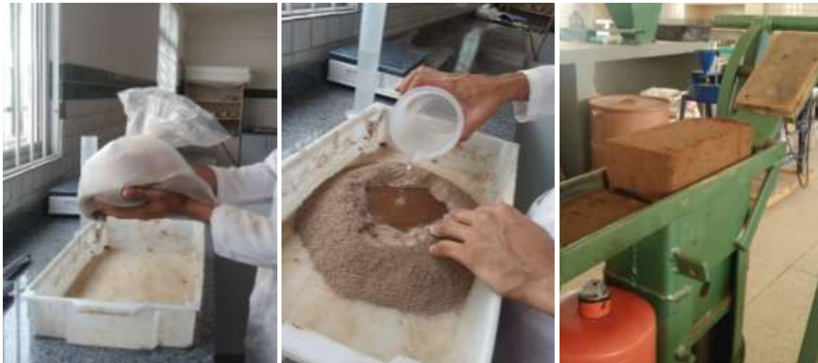
Figure 1 – Dry, wet homogenization and hydraulic press making, respectively.

The reference formulation, after planning, resulted in 1:9:1 (cement, soil and water) for the manufacture of the reference trace and the others with the addition of tailings. The procedure adopted began with mixing the materials dry with the aid of plastic bags, and then homogenizing the mixing water, manually, with a step of 1 brick at a time in a hydraulic press (Figure 1).