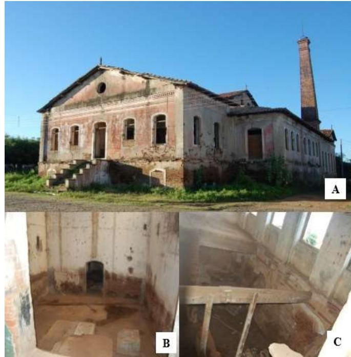
Figure 1 - A - External view. B and C - Internal view of the Dairy Factory in the County of Campinas do Piauí.