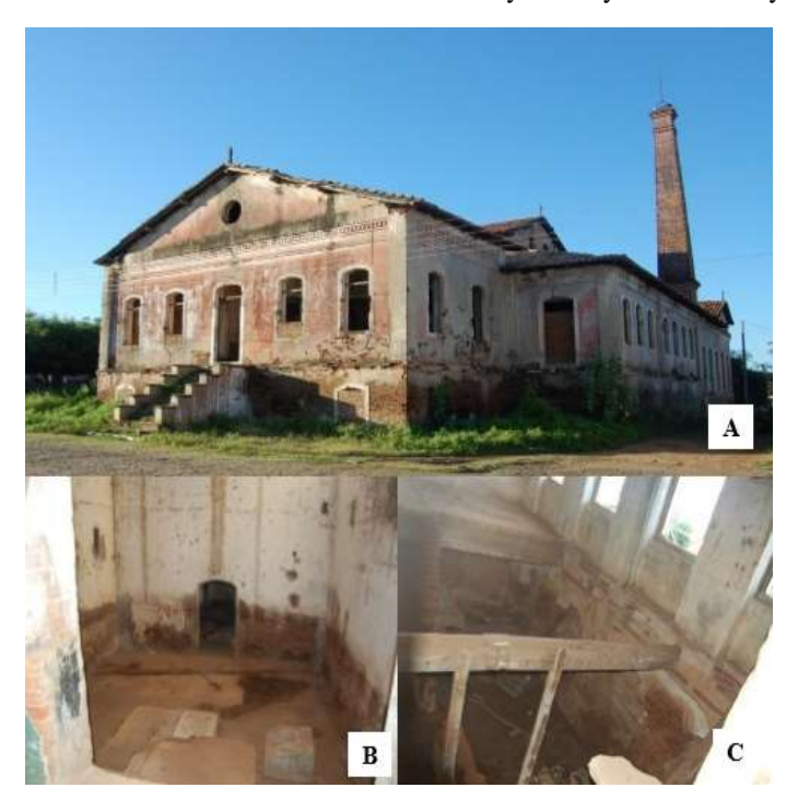
Figure 1 - A - External view. B and C - Internal view of the Dairy Factory in the County of Campinas do Piauí.