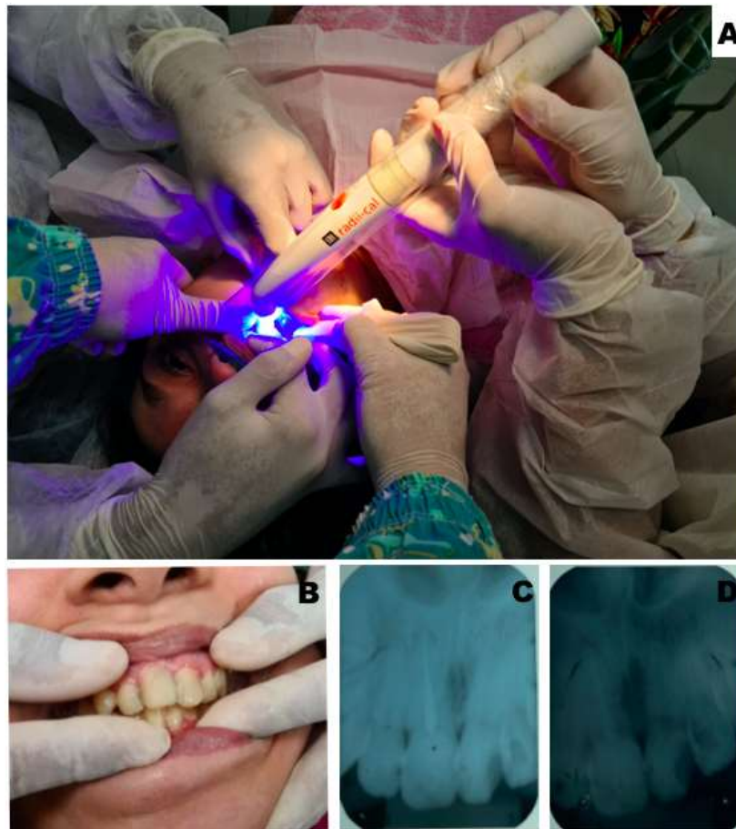
Figure 4. Procedures Performed.