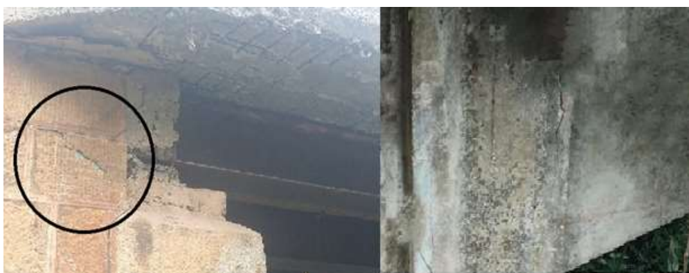
Figure 4. Pathological manifestations found in the analyzed bridge.

In Figure 4, it is possible to see the pathology of fissure and efflorescence. Cracking is characteristic of the event in which the resistive stress of the part of the structure receives more stresses than it can withstand. Cracks, even those of very small dimensions, facilitate the continuous deterioration of concrete by corrosion processes, which can compromise the structure. In addition, they may indicate the presence of stresses not foreseen in the artwork or even the loss of the structure's resistive capacity. Efflorescence, according to Neville (1997), is more likely to occur when cold and rainy weather is followed by a dry and hot period, which is recurrent in the city of Teófilo Otoni, given its climatic variations. It is also possible to identify, in Figure 4, whitish spots, which possibly are from salt deposits; and, on the underside of the slab, there appear to be stalactite-type deposits at some points. A search for records about the work, through design, documents, photos of its construction, or dialogue with residents, allows a more precise determination of the causes of the pathological manifestations found and can help in the formulation of appropriate maintenance interventions.