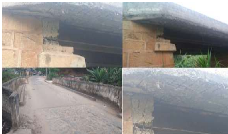
Figure 3. Pathological manifestations found in the analyzed bridge.

In Figure 3, the main pathologies diagnosed in the concrete structure under study are presented. The degradation and segregation of the concrete are visible, there is a concentration of coarse aggregates at the bottom of the slab and the support, and the reinforcement of the structure and the effects of its corrosion are observed. In addition, the surface elements of the structure show clear signs of moisture and infiltration, probably caused by some failure in the drainage elements. There are signs of the leaching process and the presence of salt deposits (efflorescences). Such pathological manifestations have probable origins thanks to the inadequate design, the execution of the work, or the quality of the materials used, possibly such problems are aggravated by the lack of periodic maintenance and age of the work, according to Helene (1992).