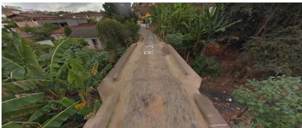
Figure 2. Satellite image of the analyzed bridge.

The Figure 1, above, shows the details of the location where the studied bridge is located. Note that it is located in the city of Teófilo Otoni, in the state of Minas Gerais, in Brazil. The photos were arranged schematically for better understanding and visualization.