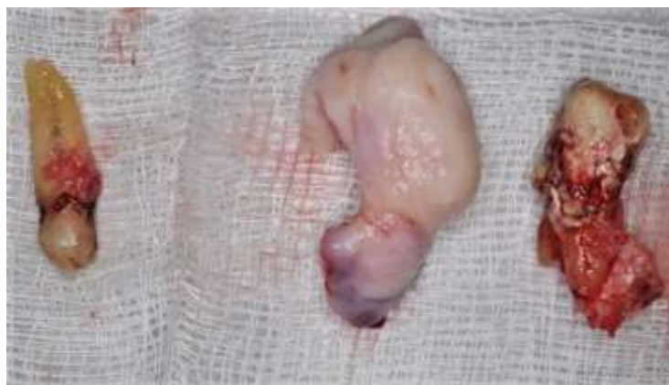
Figure 3 - fragment of complete lesion and teeth 14 and 15 after performing a surgical procedure (excisional biopsy + extractions) performed in an outpatient setting.

The diagnostic hypothesis was a peripheral ossifying fibroma and differential diagnosis of peripheral giant cell lesion. An excisional biopsy was performed together with extraction of the involved teeth (Figure 3).