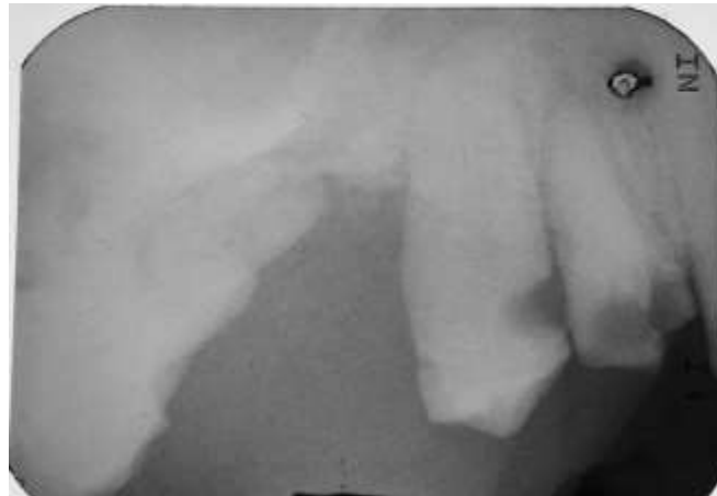
Figure 2 - periapical radiography showing that the lesion caused irregular bone resorption involving teeth 14 and 15 that had mobility.