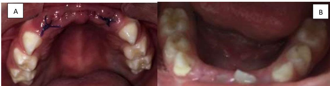
Figure 4. Clinical view of the patient's maxillary (A) and mandibular (B) arches after dental treatment.