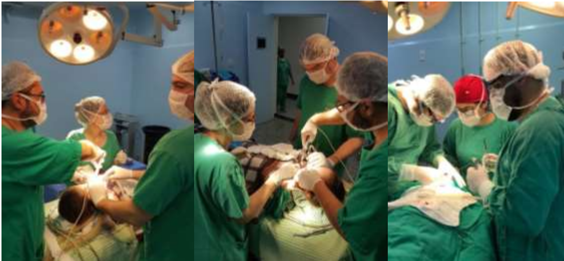
Figure 3. Dental team during treatment under general anesthesia in the hospital setting.

First of all, a professional dental prophylaxis was performed using a rubber bowl with pumice at low-speed in all the teeth. Then, glass-ionomer cement (GIC) Ketac™ Molar Easymix (3M, Two Harbors, Minnesota, United States) fillings and composite sealants with Vitremer™ (3M, Two Harbors, Minnesota, United States) were done, corresponding to all invasive procedures, such as indirect pulp capping with Biocal™ Calcium Hydroxide Lining Cement (Biodinâmica, Iporã, Paraná, Brazil) and tooth extractions. Finally, local fluoride varnish Duraphat™ (Colgate-Palmolive, New York City, New York, United States) was applied to all white spots. At the recovery room, after the child was asleep, functional aesthetic rehabilitation was performed with a partial removable prosthesis in the upper arch. Although there were extractions in the lower arch, it was not necessary to install aesthetic rehabilitation, because the incisors were semi erupted. All teeth corresponding to each treatment are described in Chart 2 (Figure 3). Antibiotic prophylaxis 1g of intravenous Cefazolin was performed at the time of the surgical procedure.