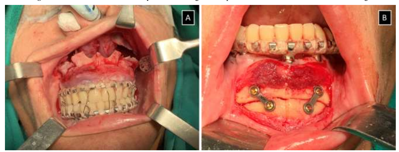
Figure 4A and 4B: A - Intermaxillary fixation throughout the prostheses. B – Chin reduction and anchoring.