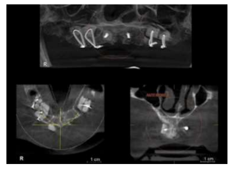
Figure 2: Computed tomography after maxillary graft.

The patient was advised not to wear the prostheses for 5 months to improve the graft healing. A new pair of provisional prostheses was made and relined with soft material. Also, the prostheses were used for reverse planning as a surgical guide. New imaging exams (computed tomography) (Figure 2) were performed afterward, showing an increase the alveolar ridge bone level and a better condition of the maxillary arch to receive implants.