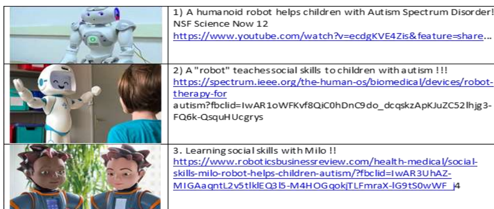
Figure 1: Robots for autismo.

Regarding creations 3 intermediate information that we "have" in the equipment with the configurations of the spectrum of the original (ASD).