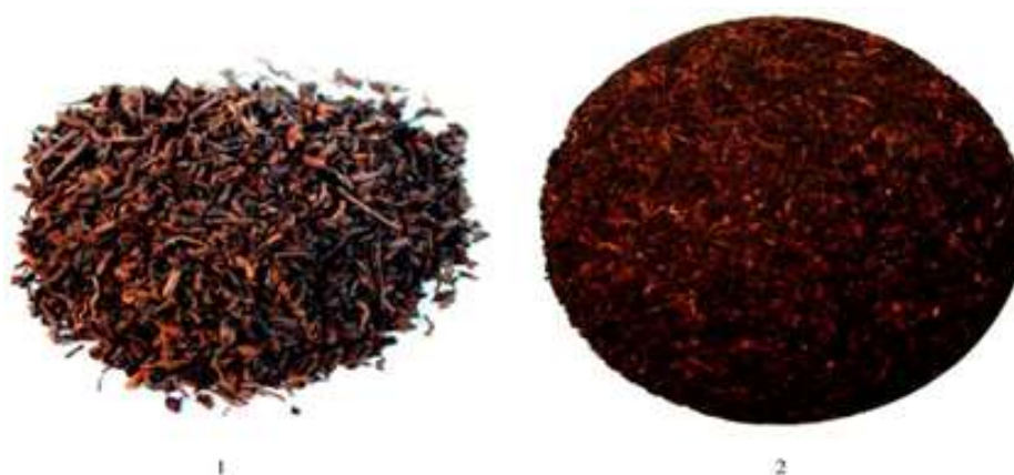
Figure 2 - Presentation forms of Pu- erh tea: (1) loose form and (2) compressed.

produced from sun-dried green tea using an autoclave and compression process. Ripened tea is produced in the same way as raw tea, but fermentation takes place in a short and intense time, with a stack fermentation that lasts from one to two months (Cao et al., 2021). In addition to these classifications, it can also be found in its loose or compressed form (snapshot) as shown in Figure 2 (Lee; Foo, 2013).