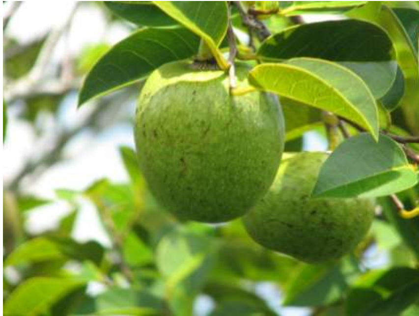
Figure 1. Annona glabra L.