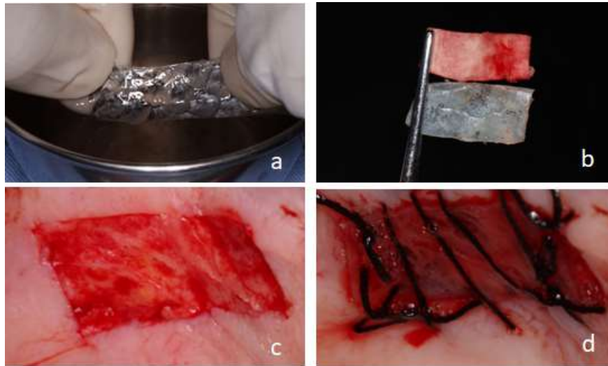
Figure 1. A) NTS was briefly washed and massaged for 5 minutes three times to remove all glycerol. B) NTS dimensions were adjusted following the surgical map used for harvesting the graft. C) Palate donor site after the removal of 1 mm thick gingival graft. D) The NTS was sutured and stabilized covering the palatal wound.