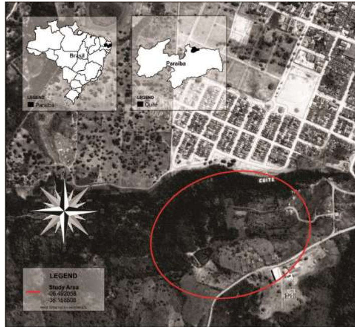
Figure 1 - Location of Leptodactylus macrosternum sampling points in the Horto Florestal Olho d'Água da Bica (HFODB) area in the municipality of Cuité - state of Paraíba – Brazil between January and December 2013.