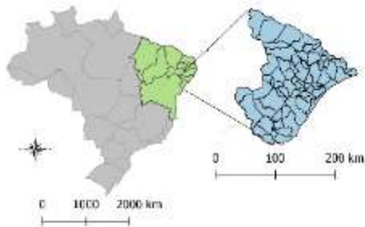
Figure 1. Map of Brazil with emphasis on the Northeast region and the state of Sergipe.

This is an ecological population-based study of the retrospective time-series type, using techniques of spatial analysis and bivariate and multivariate logistic regression. For this study, data from all cases of leprosy recurrences notified by the health centers of the municipalities to the SINAN (Information System on Notifiable Diseases) in the state of Sergipe, Brazil, from 2007 to 2017, were used. This system consists of a database of the Secretariat of Health of all states in Brazil, to report information on sociodemographic and clinical characteristics and the address of mandatory reporting diseases (Santos et al., 2019). The study took place in the state of Sergipe (Figure 1). It is one of the nine states located in the Northeast of Brazil; whose capital city is Aracaju. It is the smallest Brazilian state with a territory of 21,962.10 km 2 . In its administrative political organization, it has 75 municipalities grouped in three mesoregions and 13 microregion (IBGE, 2019).