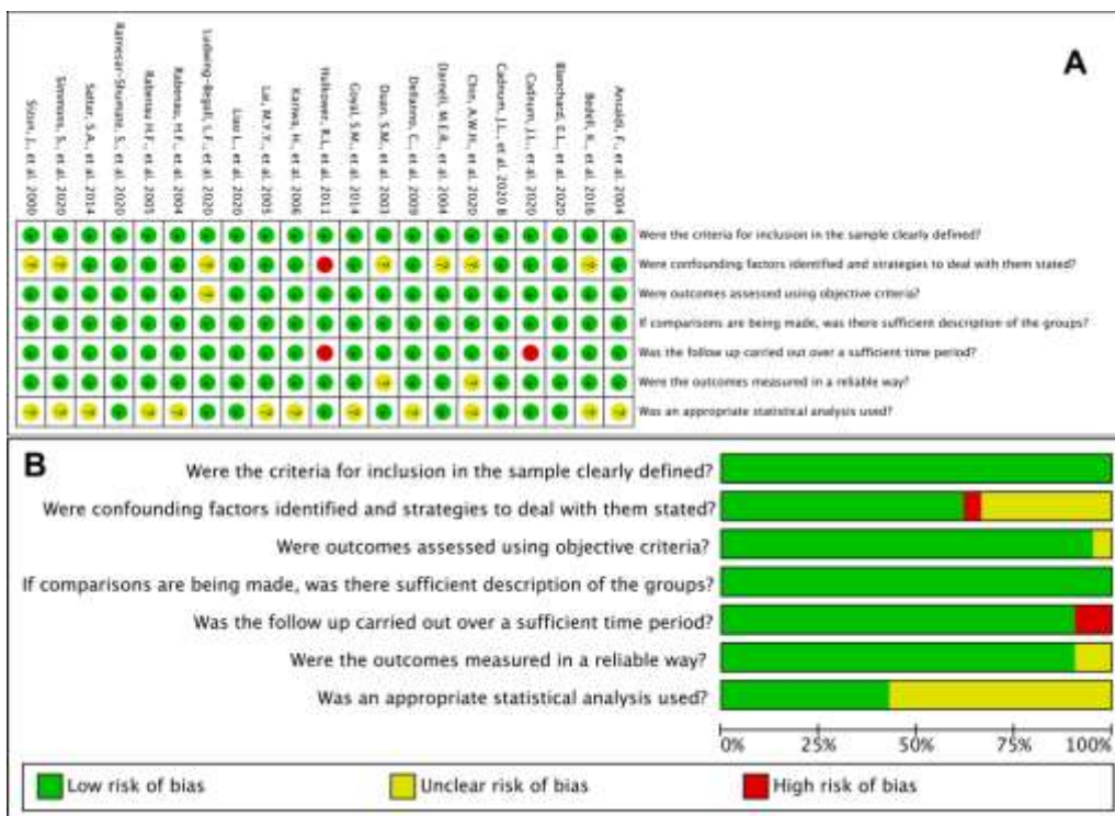
Figure 2 - Meta-Analysis of Statistics Assessment and Review Instrument (MASTARI) critical appraisal tools. Green indicates a low risk of bias, yellow indicates an unclear risk of bias, and red indicates a high risk of bias.

Of the total articles included, twenty studies were classified as having a low risk of bias. Only one study was classified as having a moderate risk of bias, mainly due to the lack of information sufficient to provide an adequate judgment (Figure 2 and Supplementary material 1).