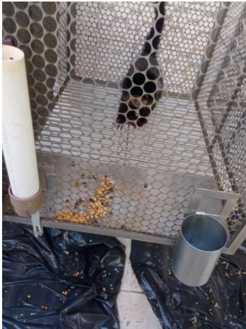
Figure 2. The individual cages on the floor lined with a plastic bag half from the floor.