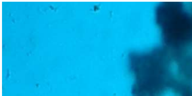
Figure 4. Negative slide image for the protozoan Cryptosporidium spp. according to the Malachite Green Negative Staining Technique.