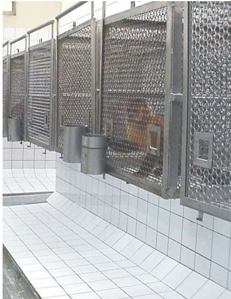
Figure 1. Monkeys housed in individual stainless steel cages, with sides of perforated coin-type plate, separated by 5 cm to 8 cm and a meter and a half from the floor.