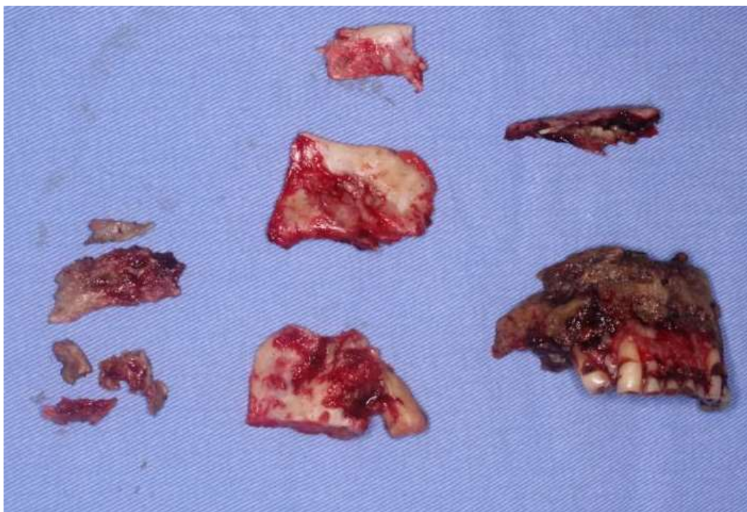
Figure 5: Mandible removed during the first surgical procedure for anatomopathological study.