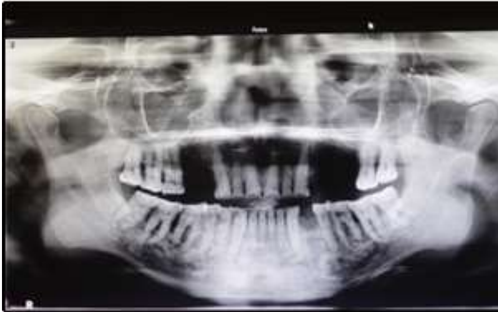
Figure 3: Panoramic radiographic with vertical and horizontal bone loss in the mandibular body region, bilaterally.