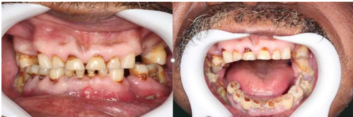
Figure 2: Cervical lesions in multiple teeth and bone exposure bilaterally.