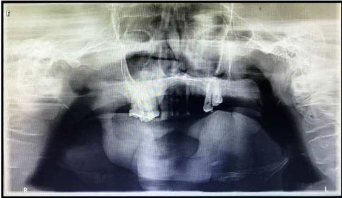
Figure 8: Panoramic radiography after hospital discharge, showing absence of synthesis material and TMJ disarticulation.