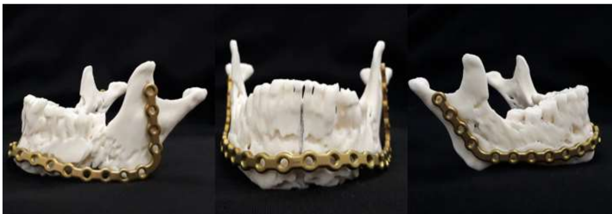
Figure 4: Biomodel used for modeling the 2.4 mm system reconstruction plate.

The surgery was planned with the aid of a biomodel (Figure 4) using a 3D printer with images of the patient's face from the computed tomography. The first surgical procedure took place at General Roberto Santos Hospital. Through bilateral submandibular access with extension and midline joint, the mandible was partially removed. The surgical specimen (Figure 5) was stored in a 10% formaldehyde container and sent to EBMSp for anatomopathological examination. Surgical debridement of devitalized soft tissue or signs of low vitality was performed. After this process, the 2.4 mm system reconstruction plate was adapted and fixed to the remnant bone of the mandible. After the surgical approach, the patient was referred for an imaging exam for postoperative control (Figure 6).