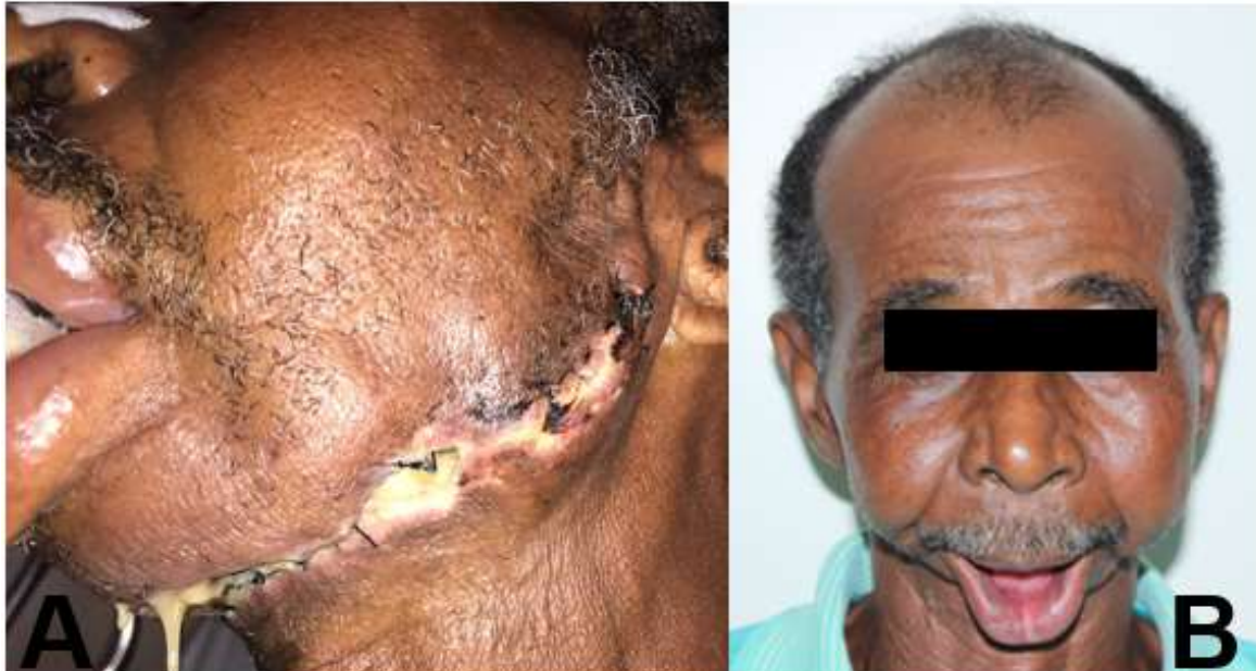
Figure 7: A: Left side, showing dehiscence in the suture and presence of purulent secretion; B: Patient in the 11th postoperative month, here we observe lower lip ptosis.

After the second surgical procedure, the patient evolved with an improvement in the infection, using a nasoenteral tube for feeding, with spontaneous breathing via tracheostomy, and without pain complaints in the surgical access region. We continued the treatment through daily monitoring with the oral maxillofacial team, which changed the dressing twice a day and oral hygiene with aqueous chlorhexidine 3 times a day. After clinical improvement, the patient evolved with difficulty in accepting an oral diet. A gastrostomy procedure was needed to ensure a better nutritional condition for the patient. To date, the patient (Figure 7-B) is being followed up with the oral maxillofacial team at the EBMSF. He underwent a panoramic radiographic (Figure 8) of post-control operative and received the result of the anatomopathological exam, which was conclusive for ORN.