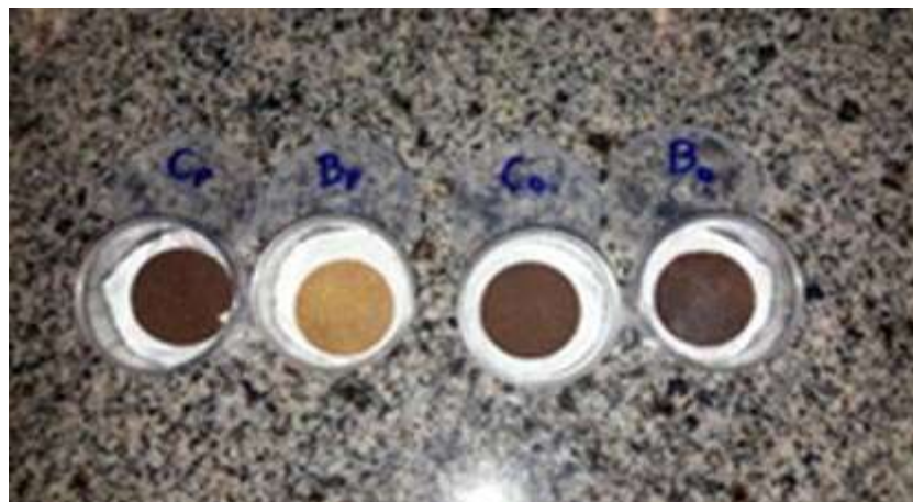
Figure 1: Tablet samples of silver banana peel (Cp), silver banana pulp (Bp), gold banana peel (Co), gold banana pulp (Bo).

As soon as the sample masses remained constant, they were crushed in a blade mill (IKA, model A11 basic). Each crushed sample was sieved. With a precision scale (BEL Engineering Model: M254A) approximately 500mg of each sieved sample was separated. With a compactor and a hydraulic press (MARCON, Model: MPH-10), the samples were pressed for 10 minutes at a pressure of 1.93 \times 10^8 Pa. At the end of this process, silver and gold banana pulp and peel tablets were obtained. Each 2.54 cm diameter insert. Figure 1 shows the formed inserts. Tables 2 and 3 show the masses and densities of the tablets.