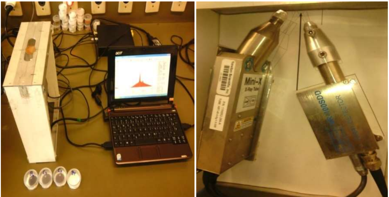
Figure 2: Irradiation setup.

The spectra obtained from the AMPTEK DppMCA program provided the chemical elements of the samples. With the aid of the AXIL program, we obtained the sum of the area of all peaks for each spectrum. Afterwards, we calculated the average of the three measurements for each element's peak area divided by the counting time ( t_i ). Figure 2 illustrates the irradiation setup. For absorption coefficients and sensitivity, the values used are shown in Tables 4 and 5.