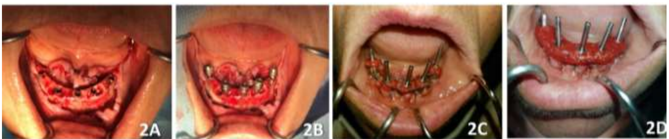
Figure 2: 2a-installed implants; 2b: Implants with their respective minipillars and protective cylinders; 2c and 2d: Open tray transfers united with metallic wire attached with resin.

The next day, the molding began by placing the transferences and uniting them with Patern® resin and steel wires. Then the molding with open tray was performed using addition silicone. Analogues were placed in the odontological tray and joined with steel wires and Patern Resin® (Figure 2c and 2D), and then the plaster was leaked (TipoIV).