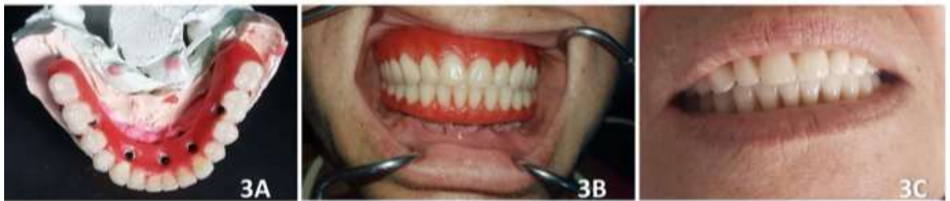
Figure 3: 3a: wax-mounted teeth on the metallic structure; 3b: proof of wax-mounted teeth: superior total prosthesis and lower protocol; 3c: installation of upper total prosthesis and the lower protocol.