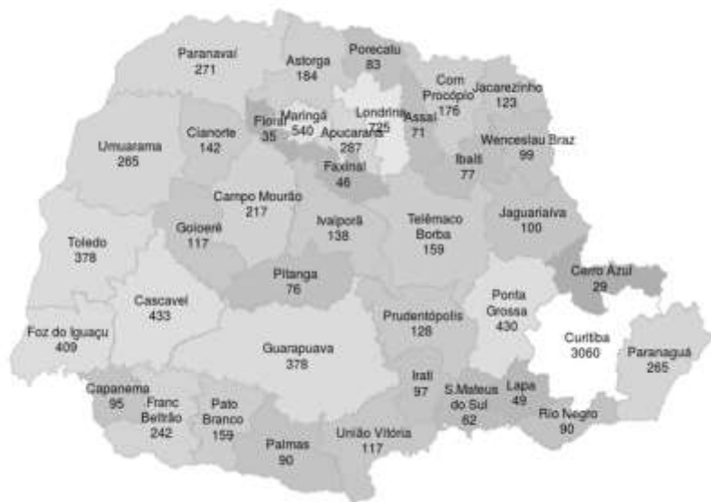
Figure 1. Map of Paraná's micro-regions and their respective resident populations expressed in thousands in 2010.

The map of Paraná's micro-regions, with their respective resident population (expressed in thousands) in 2010 are shown in Figure 1. In 2010, Paraná's population was estimated to be 10,444,526 inhabitants. As such, the annual road traffic accident death rate in the same year was 33.0 per 100,000 inhabitants.