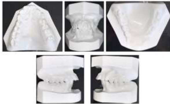
Figure 2: Pretreatment dental casts.