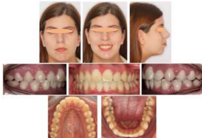
Figure 4: Posttreatments extraoral and intraoral photographs.