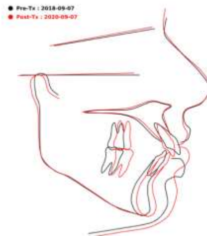
Figure 7: Superimposition of pretreatment and posttreatment cephalometric radiographs.

The overlap of cephalometric tracings revealed a reduction of the incisors' angulation, lip sealing and mesialization of the second superior and inferior molars, which allowed for the passive eruption of the third molars (Figure 6). The post-treatment cephalometric analysis (Table 1) showed retro inclination of the superior and inferior incisors, reduced angulation of the interincisors. These changes can be seen in the cephalometric superimposition (Figure 7).