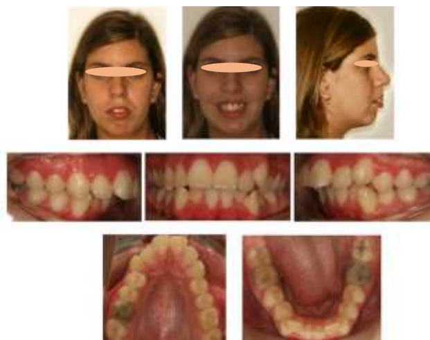
Figure 1: Pretreatment extraoral and intraoral photographs.

Facial analysis showed slight asymmetry, incompetence lip, convex face with bimaxillary protrusion, and dolichofacial type. Physical examination and model analysis found complete permanent dentition, crowding in both arches (3 mm in the upper and 7 mm in the lower), Class II molar and canine relationships, 8 mm overjet and 3mm overbite; and 3 mm of a discrepancy between U/L midline (Figure 1-2).