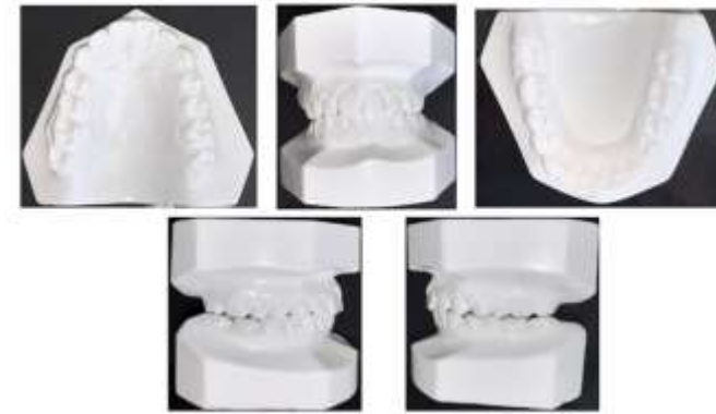
Figure 5: Posttreatment dental casts.