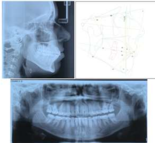
Figure 6: Posttreatment lateral cephalometric radiograph, cephalometric tracing and panoramic radiograph.