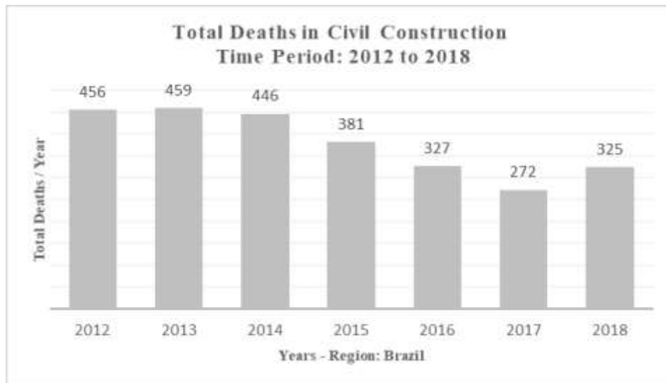
Figure 1 - Total deaths between the years 2012 to 2018 in civil construction.

In the period from 2012 to 2018 there was an average of 381 fatal accidents at work in civil construction, according to data from the Observatório Digital de Saúde e Segurança do Trabalho (SmartLab, 2020). Figure 1 below shows the numbers of deaths in civil construction, according to the Statistical Yearbook of Work Accidents - AEAT (AEAT, 2020).