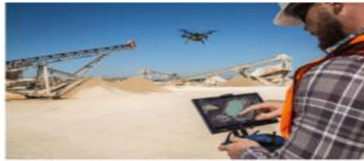
Figure 8 - Drones in construction.