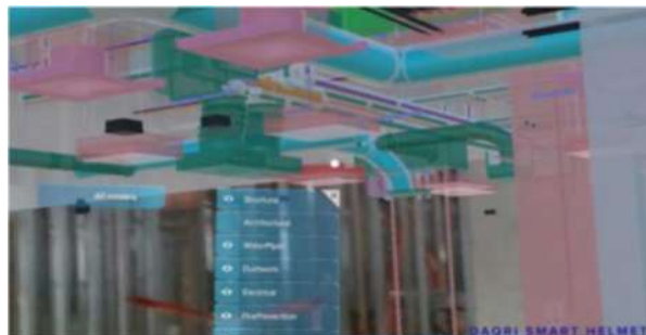
Figure 4 - Helmet vision with smart glasses: constructive details are shown, which are only in the design.

There are also helmets with smart glasses, or smart glasses that allow the user to quickly access their field of vision: manuals, instructions or even remote support, while keeping their hands free to focus on the tasks being developed (Oesterreich & Teutebrg, 2016), as in Figure 4.