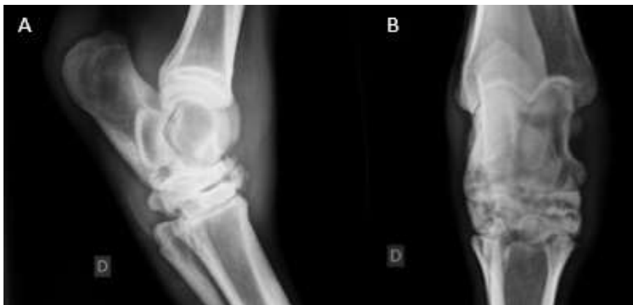
Figure 1 – Radiographic image of the tarsal joints of the right hind limb. A: lateromedial view. b: dorsoplantar view. Bone proliferation can be observed in the area located dorsally to the central tarsal bone and the third tarsal bone. Articular collapse of the proximal and distal intertarsal joints. Sclerosis of the tarsal cuboid bones. Irregularity at the subchondral bone of the lateral trochlea of the talus.

The radiographic and ultrasonography evaluations revealed the rupture and intraarticular invagination of the articular capsule at the TC joint, along with osteoarthritis of the PIT, DIT, and MTM joints, and an OCD lesion at the lateral trochlea of the talus. Arthroscopic surgery was performed to remove the articular capsule fragment and to treat the OCD lesion. Before the procedure, a blood sample was taken, which revealed neutrophilia without leukocytosis.