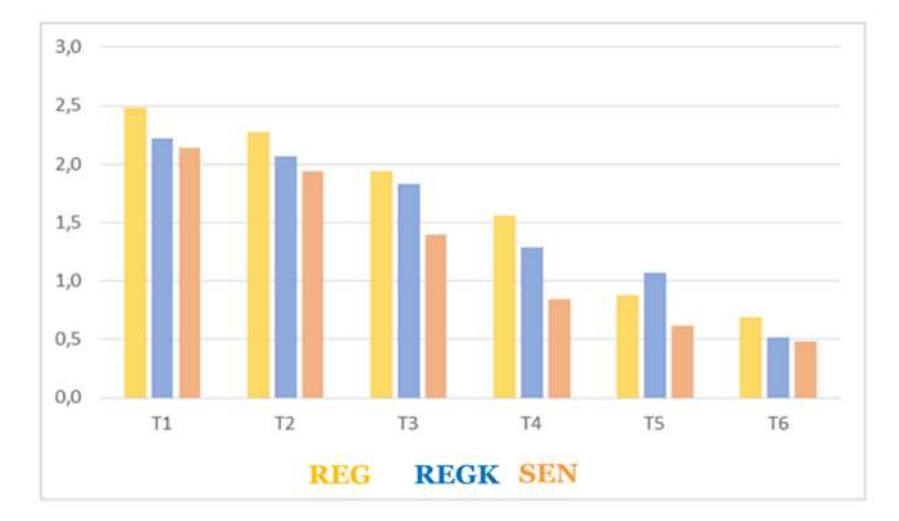
Figure 3 – Patient perception for SEN, REG and REGK groups. REG presented a DH mean of 70 at T1 and 26 at T6. REGK presented a DH mean of 64 at T1 and 21 at T6. SEN presented a DH mean of 59 at T1 and 17 at T6.