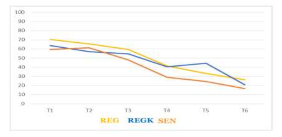
Figure 2 - Professional evaluation in SEN, REG and REGK groups. REG group presented a DH mean of 2.5 at T1 and 0.7 at T6. REGK presented a DH mean of 2.2 at T1 and 0.5 at T6. SEN presented a DH mean of 2.1 at T1 and 0.5 at T6.

The professional evaluation showed a significant reduction in DH with the use of all three technologies (2.26 to 0.56) after T4 (p<0.05) (Figure 2). All patients initially presented moderate to severe pain (64.3) and after treatments reported mild pain (21.3).