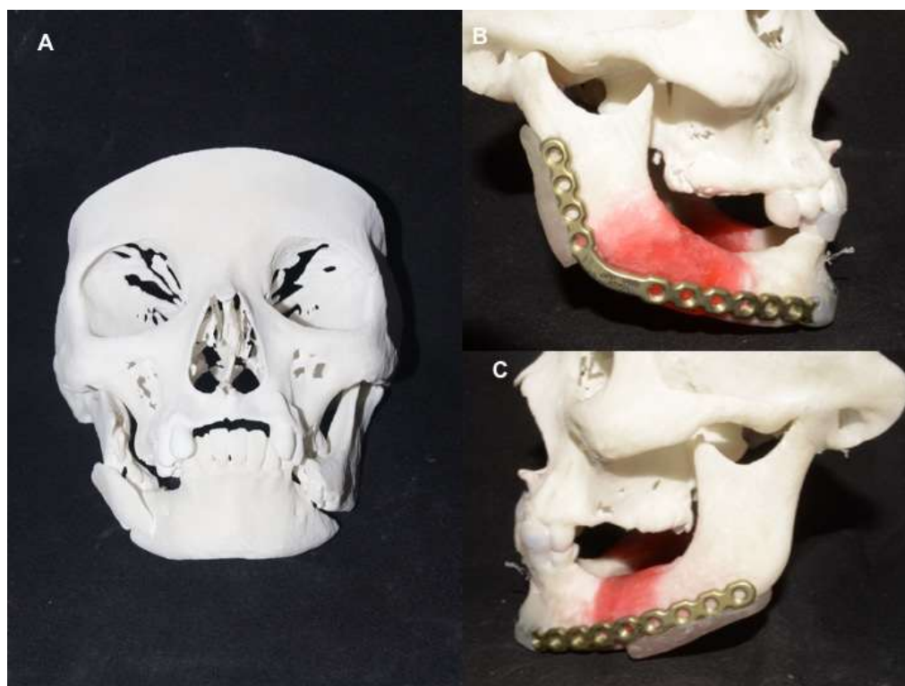
(A) Full-size skull and mandible prototype, made of polyamide. (B/C) Pre-bending of the right and left reconstruction plates.

The patient underwent surgical procedure under general anesthesia by nasotracheal intubation. The transcervical incision was performed for wide bilateral exposure of the fractures, to allow positioning of the fixation material (Figure 3). After complete exposure, the segments consolidated on the right side were mobilized with a surgical hammer and chisels. On the left side, debridement of the fibrous tissue placed between the fragments was performed. After mobilization of the bone segments, intermaxillary blocking screws were installed, followed by maxillomandibular immobilization with steel wire, with the aid of an occlusal template. After positioning the mandible to obtain the appropriate occlusion, the segments were reduced and stabilized with the 2.4 locking system pre-bend plates, that served as a reference for the final mandibular position. In addition to the two pre-bend reconstruction plates, a 2.0 plate was used on the left side (Figure 3). The remaining fragments were used as free graft on the left side, but on the right side a major remodeling had occurred, leaving a significant defect. The immobilization material was removed and the sutures were placed. The entire procedure took place without any intercurrence