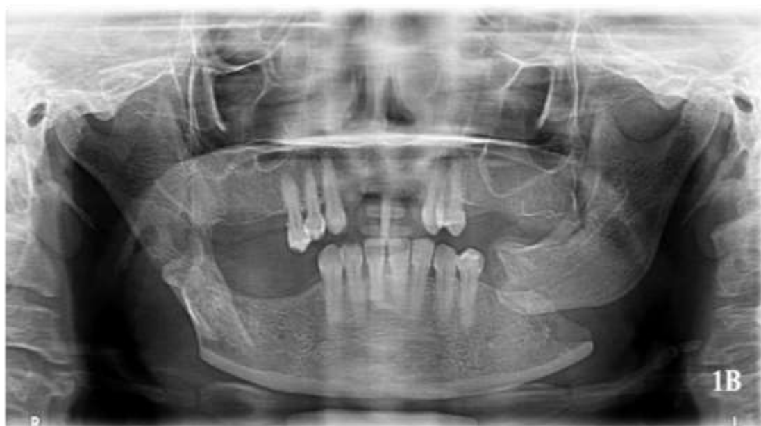
Figure 1. Preoperative panoramic radiograph.

Preoperative panoramic radiograph showing a fracture in the region of the right mandibular angle and in the left mandibular body, severely displaced.