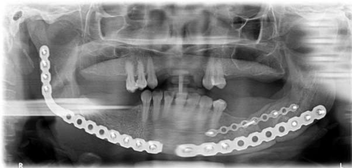
Figure 4. Postoperative panoramic radiograph.

Postoperative radiograph showing adequate bone contour, good positioning of the reconstruction plates and consolidation of the fractures on the left side.