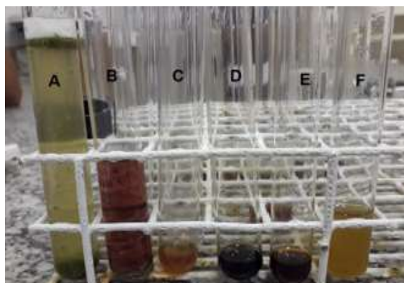
Figure 1 - Result of the phytochemical prospecting of the leaf Eugenia uniflora L. Positive test for (A) Saponin, (B) Flavonoid, (C) Alkaloid, (D) Tannins and negatives for (E) Coumarin and (F) Polysaccharide.