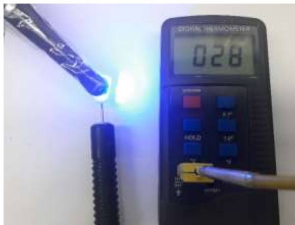
Figure 3. Digital thermometer for initial temperature measurement with heat.