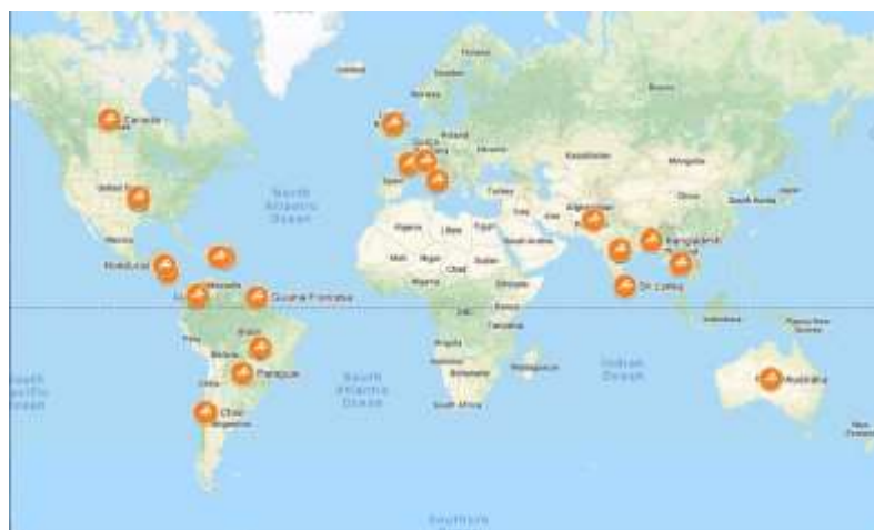
Figure 2 – Distribution of published studies according to the country where the studies were carried out.

The general characteristics of the included articles are described in Table 2, and the 19 references of the selected articles are displayed at the end of the references. Of the included reports (17; 89.5%) it was available in English and only two articles were published in Spanish. More than half of the research body was carried out in the Americas (12; 63.2%), followed by Asia (5; 26.3%), with one in Europe and one in the African continent (Figure 2). Regarding the timeline, the first published article that answered the research question of the respective study is from 2007. As for the temporal analysis of publications, there is a range of 11 years, whose interval is from 2007 to 2018 (Table 3).