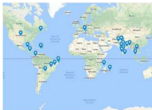
Figure 3 – Distribution of published studies according to country of origin of the researchers' institutions.

The 19 studies analyzed represent the scientific efforts of public health institutions and universities and/or research centers distributed in 15 countries: Bangladesh; Brazil; Chile; Colombia; U.S; France; French Guiana; Honduras; India; US Virgin Islands, Italy; Nicaragua; Pakistan; Paraguay; United Kingdom) (Figure 3).