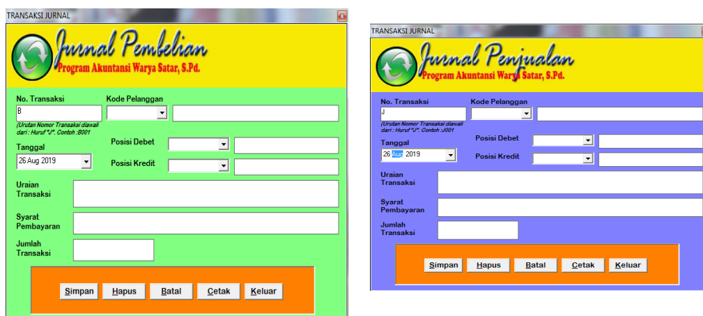
Figure 2. Display of Purchases and Sales Journal