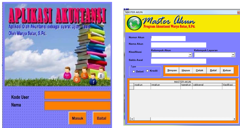
Figure 1. Display of Teaching Material Application and Data Input