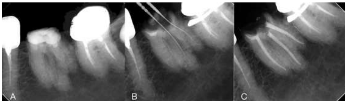
Figure 1 - (A) Initial radiograph. (B) Location of the DB and DL (Radix entomolaris). (C) Final radiograph.