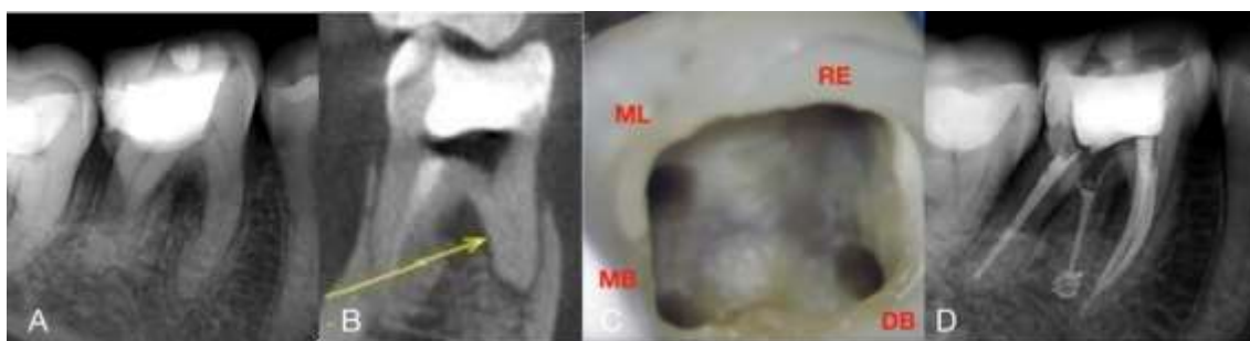
Figure 2 - (A) Initial radiograph. (B) CBCT (C) Clinical image showing canal entrances after instrumentation (D) Final radiograph.