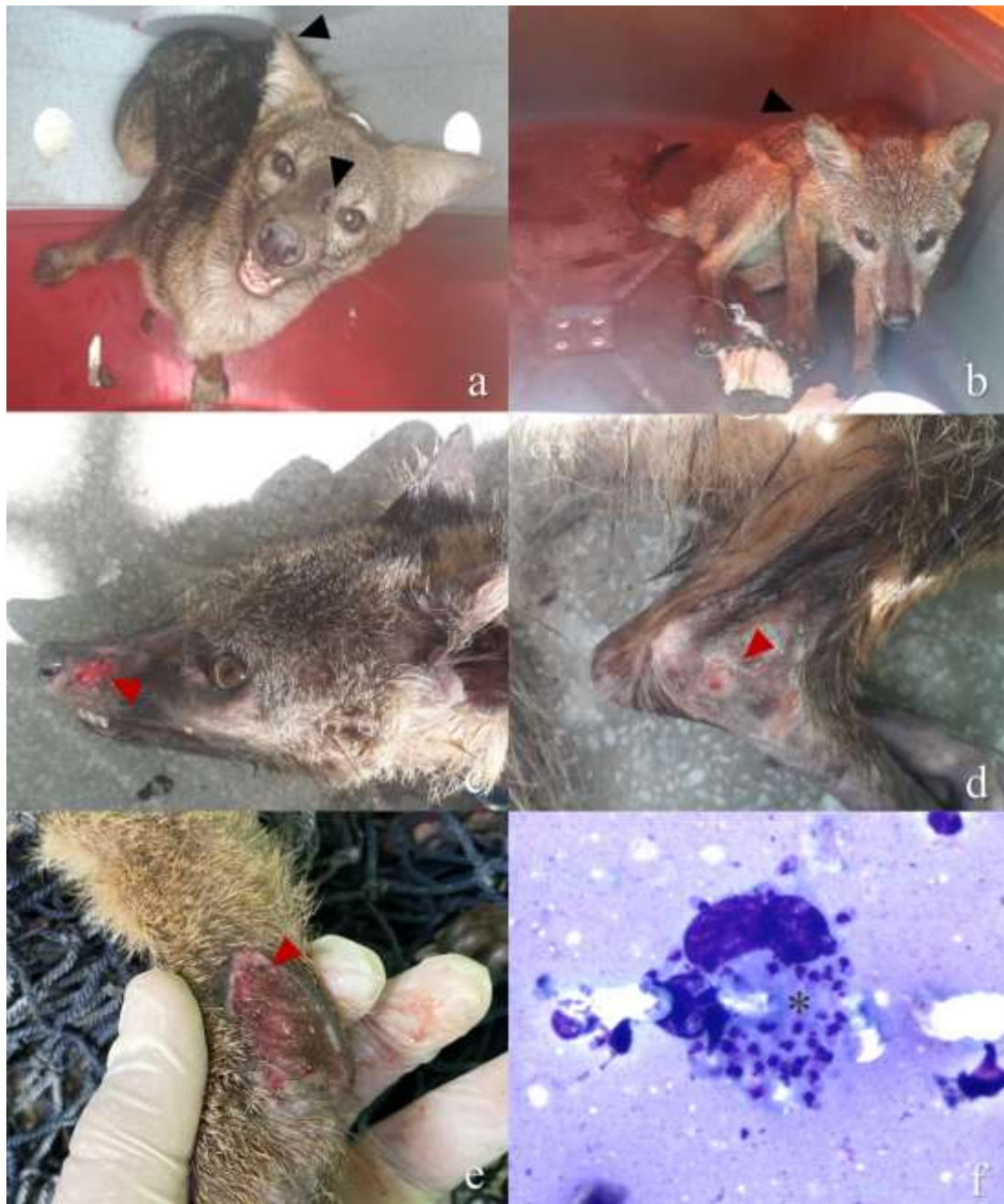
Figure 1. Clinical signs and amastigote forms of Leishmania infantum . a) Alopecia and skin lesion on the ear and nose (CF1); b) Muscle atrophy and skin lesion on the ear (CF3); c) Alopecia and ulcerative skin lesion on the nose (CF2); d and e) Ulcerative skin lesion and dermatitis in limbs (CF2); f) Amastigote forms of Leishmania infantum in scrapping of C. thous (CF2).

than 99% was observed between the consensus sequence obtained in the present study and L. infantum sequence DNA available from Genbank database. The consensus sequence was deposited at Genbank under accession number MW959170.