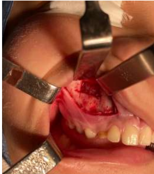
Figure 4 - The incision and displacement of the mucoperiosteal flap to access the cystic capsule, followed by enucleation of the cystic.