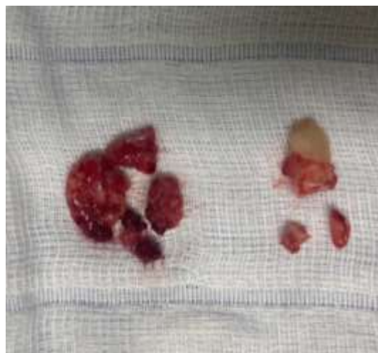
Figure 5 - The cystic capsule and tooth 13 after extraction.

We opted for curettage of the surgical site to remove the cystic capsule, extraction the tooth and refinement of the remaining bone borders. Repositioning and inter papillary suture of the flap were performed. (Figure 5)