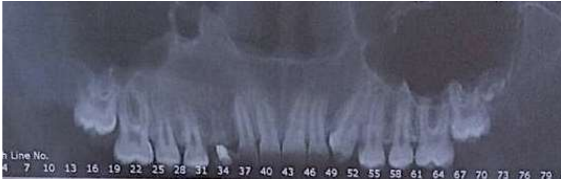
Figure 6 – The computed tomography of the 6-month postoperative period shows satisfactory bone formation at the site of the enucleation of the dentigerous cyst and no signs of recurrence.