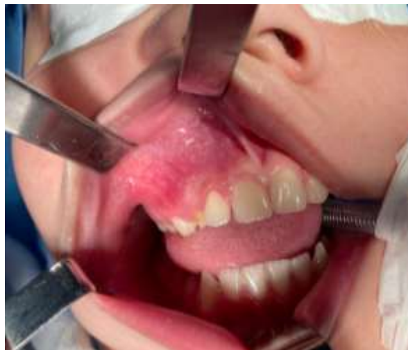
Figure 3 - The surgical procedure under general anesthesia for enucleation of the cystic capsule and exodontia of tooth 13.

It was decided to perform the surgical procedure under general anesthesia for enucleation of the cystic capsule and exodontia of tooth 13, due to malposition and making orthodontic traction unfeasible. (Figure 3)