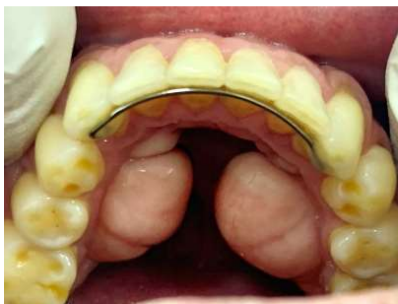
Figure 1 0 Preoperative image showing the presence of bilateral mandibular torus, being unilobular on the right side and trilobular on the left side.

Intra-oral examination significant bilateral painless masses in the lingual region of the mandible, well-defined, measuring 20x20 mm in size, hard on palpation, covered by normal mucosa were evaluated. (Figure 1) A Cone Beam computed Tomography was requested to evaluate the bone limits and extension. It revealed, on the left side, a unilobular exostosis, and trilobular exostosis on the right side, with radiopaque aspect, diagnosing the mandibular torus. (Figure 2) In surgical planning, no involvement of the mandibular exostosis with the inferior alveolar nerve was observed. Thereafter, the limits of the lobes were established for posteriorly the channels to accomplish. (Figure 3)