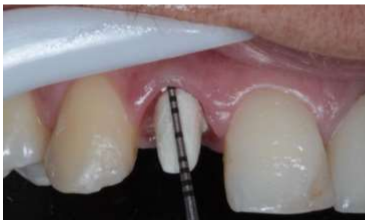
Figure 6. Final position of the teeth after the extrusion and the stabilization period.