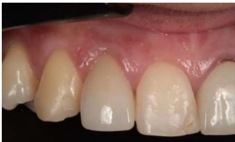
Figure 8. One year of clinical follow-up showing the lithium disilicate glass-ceramic crown.