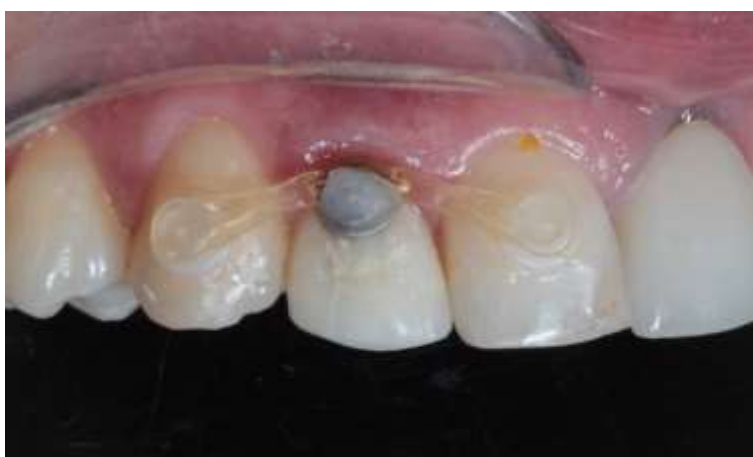
Figure 5. Fixed orthodontic buttons and elastic band used for rapid extrusion of the maxillary right lateral incisor.

Orthodontic buttons (Morelli) were bonded to the buccocervical region of the interim crown and the incisal region of both distal and mesial adjacent teeth. For the rapid extrusion of the lateral incisor, an intrasulcular incision was made above the button for the placement of an elastic band, which was supported by the adjacent teeth (Figure 5). The elastic chain was replaced every 10 days for 3 months until the cervical preparation finish line was located at 1 mm subgingivally (Figure 6). After this period, the teeth was kept stabilized in this position for 45 days to avoid any chances of the achieved position and the gingival margin was healthy enough to be restored with a ceramic crown.