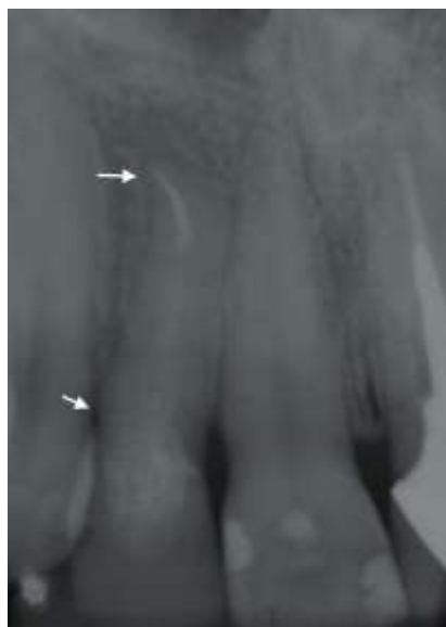
Figure 7. One year of radiograph follow-up showing apical and periodontal health.