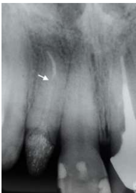
Figure 4. Radiography of maxillary right lateral incisor with radiolucent fiberglass post-and-core adequate apical fit.

The adequate fit of the milled fiberglass post-and-core was clinically and radiographically confirmed (Figure 4). Then, the surface of the post-and-core was sandblasted with 50- \mu m aluminum oxide particles, ultrasonically cleaned, dried, and silanized. The post space was cleaned with alcohol and dried. The post-and-core was luted using a dual-polymerized self-adhesive resin cement (U200; 3M ESPE). Next, a interim acrylic resin crown (Alike; GC America) was luted with the same resin cement to withstand further shear stress during the orthodontic tooth extrusion.