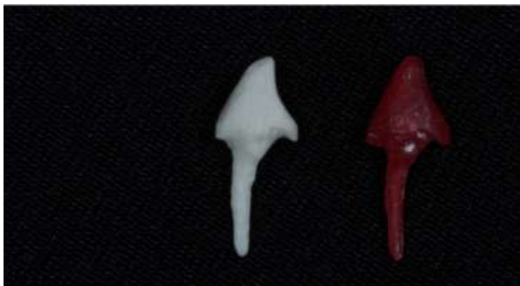
Figure 3. Milled fiberglass post-and-core (white) and acrylic pattern.

Sorensen) at low speed. Digital optical impression of the post-and-core pattern was taken with a laboratory scanner (Ceramill Map; AmannGirrbach) and the customized one-piece post-and-core was milled from a fiberglass CAD/CAM block (Fiber Cad Post & Core; Angelus) (Figure 3).