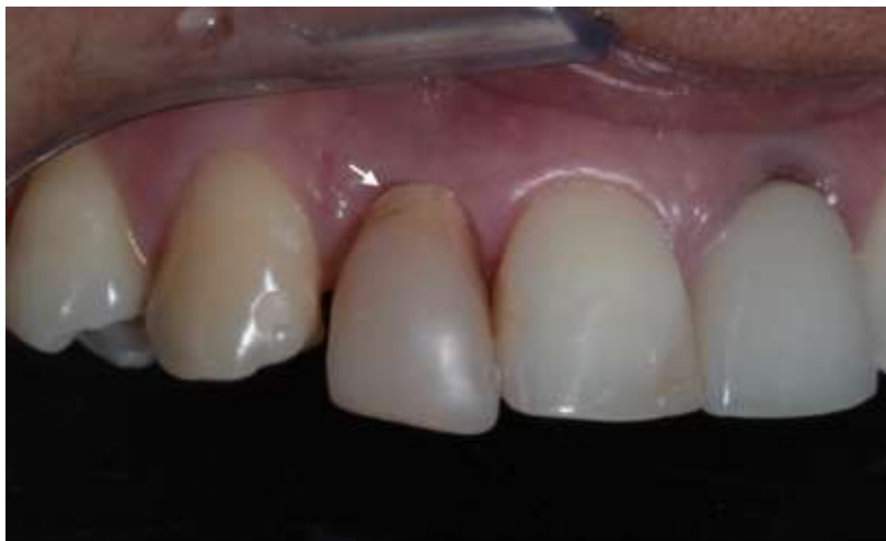
Figure 1. Initial photograph of fractured right lateral incisor with an interim crown in place.

replace the fracture line to a more favorable position. Adequate endodontic treatment and root length were observed on the radiograph (Figure 2).