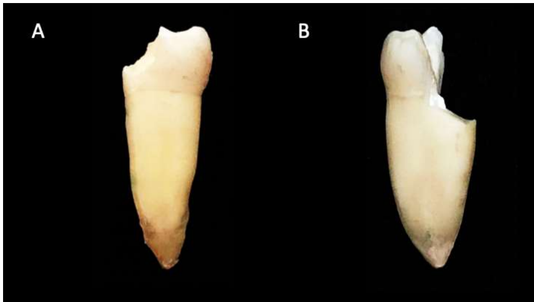
Figure 3. Representative images of the restorable (A) and unrestorable (B) fracture pattern.